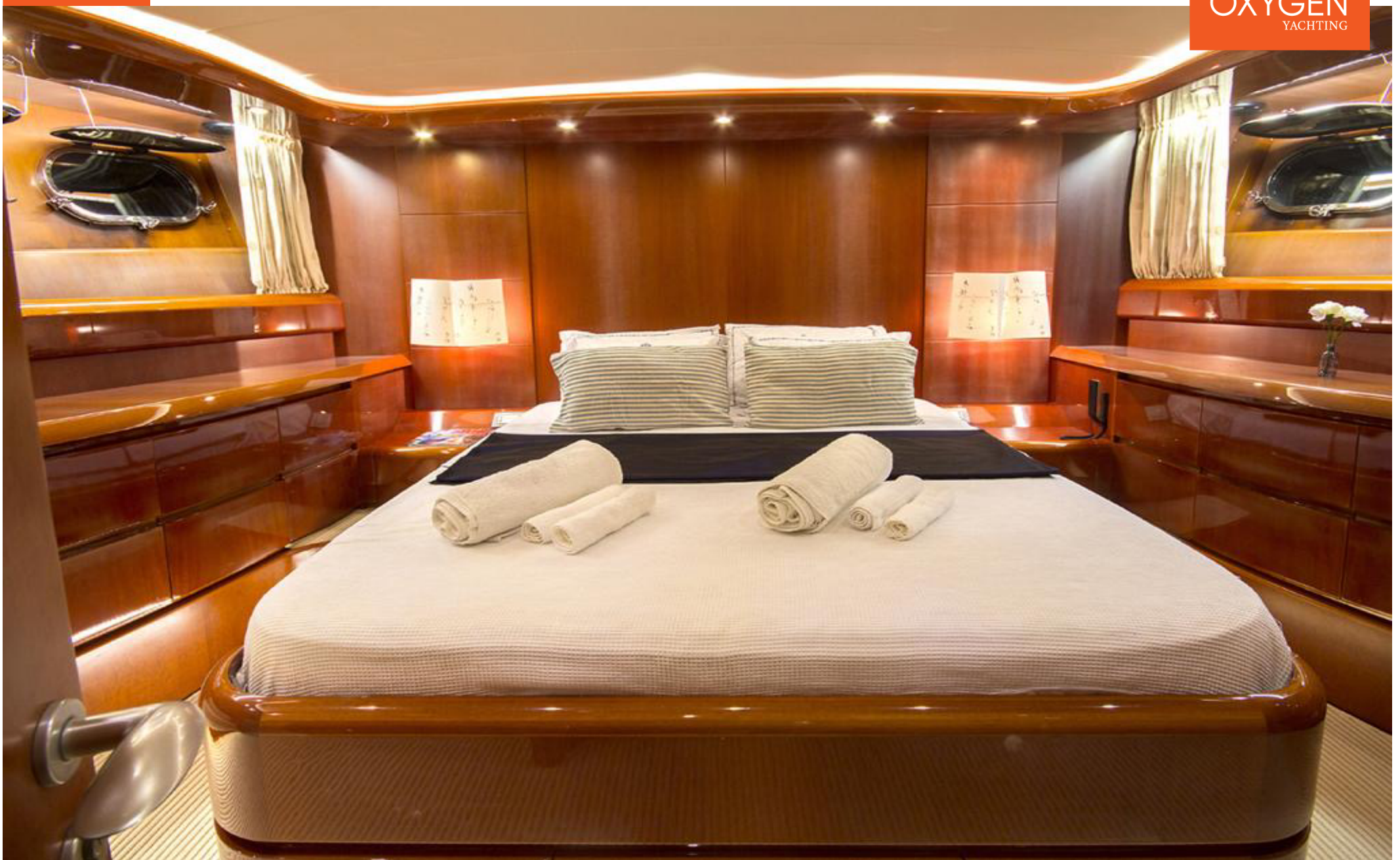
MOTOR YACHT | 26m | 2003 (Refit 2018)