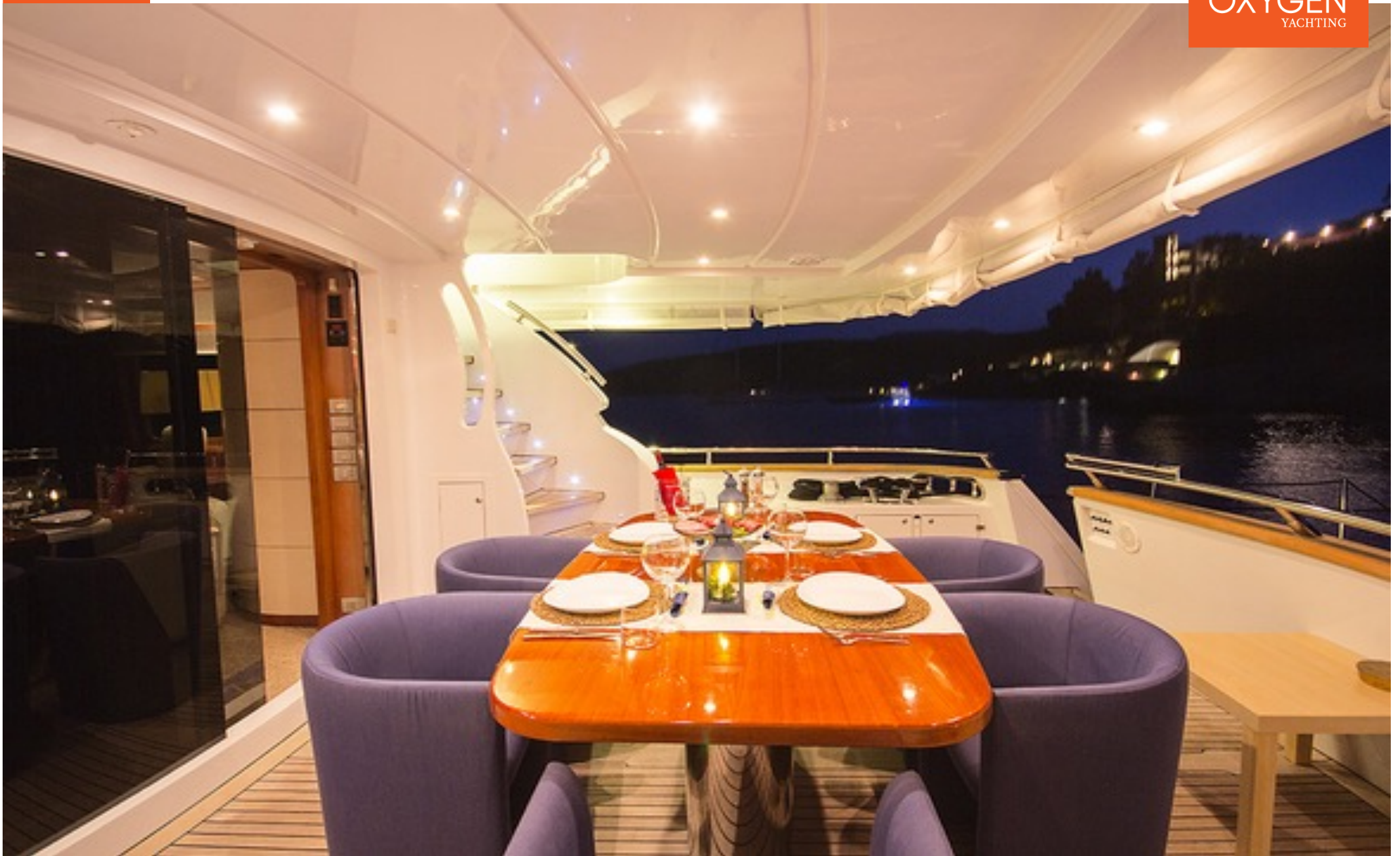
MOTOR YACHT | 26m | 2003 (Refit 2018)