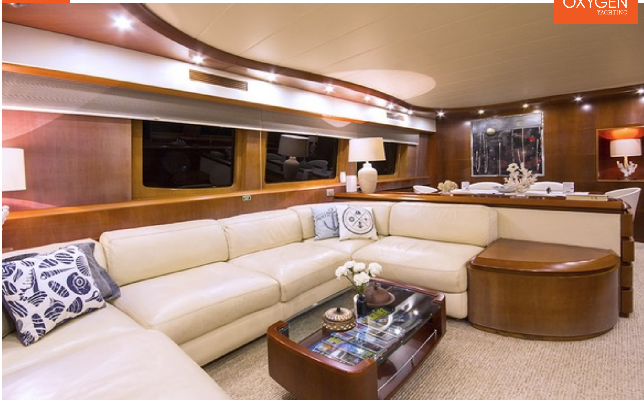
MOTOR YACHT | 26m | 2003 (Refit 2018)