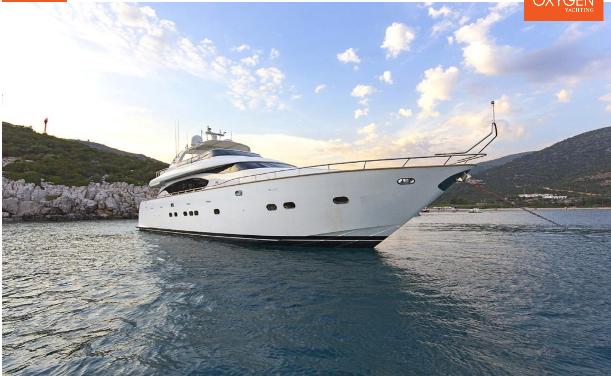
MOTOR YACHT | 26m | 2003 (Refit 2018)