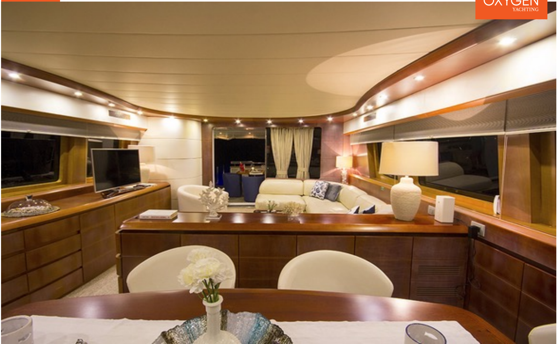
MOTOR YACHT | 26m | 2003 (Refit 2018)