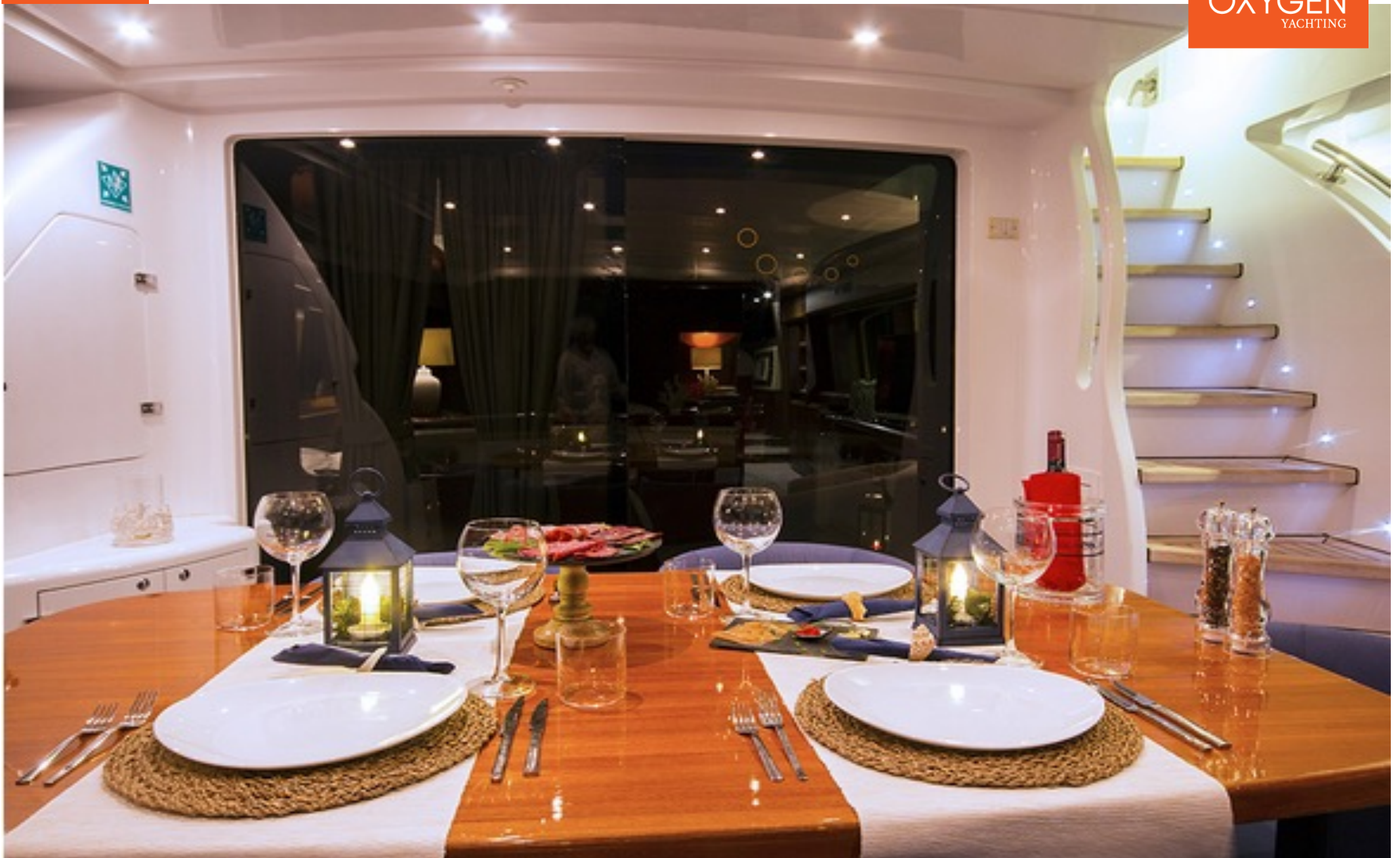
MOTOR YACHT | 26m | 2003 (Refit 2018)