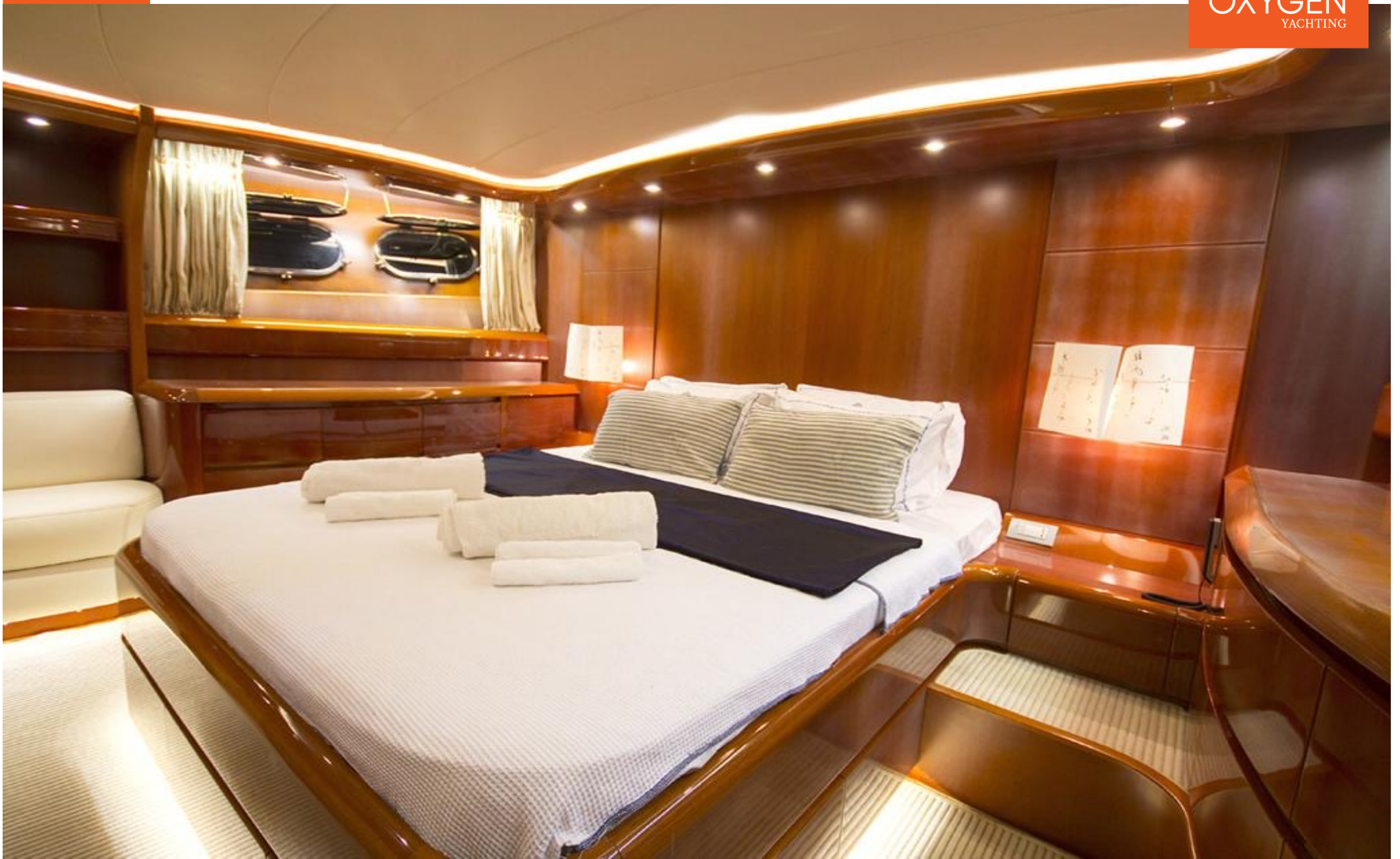
MOTOR YACHT | 26m | 2003 (Refit 2018)