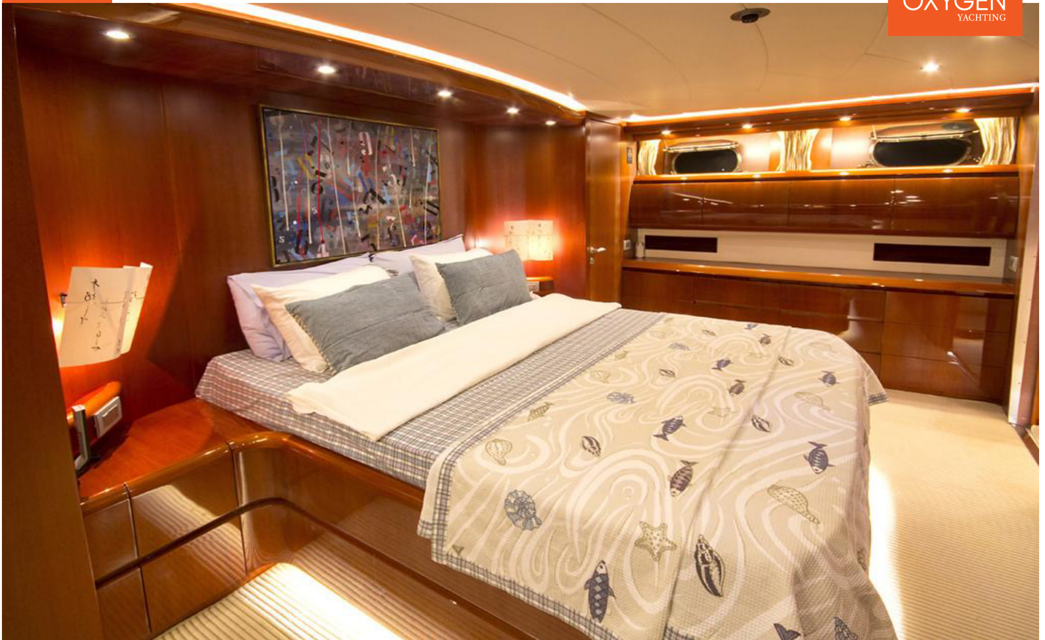
MOTOR YACHT | 26m | 2003 (Refit 2018)