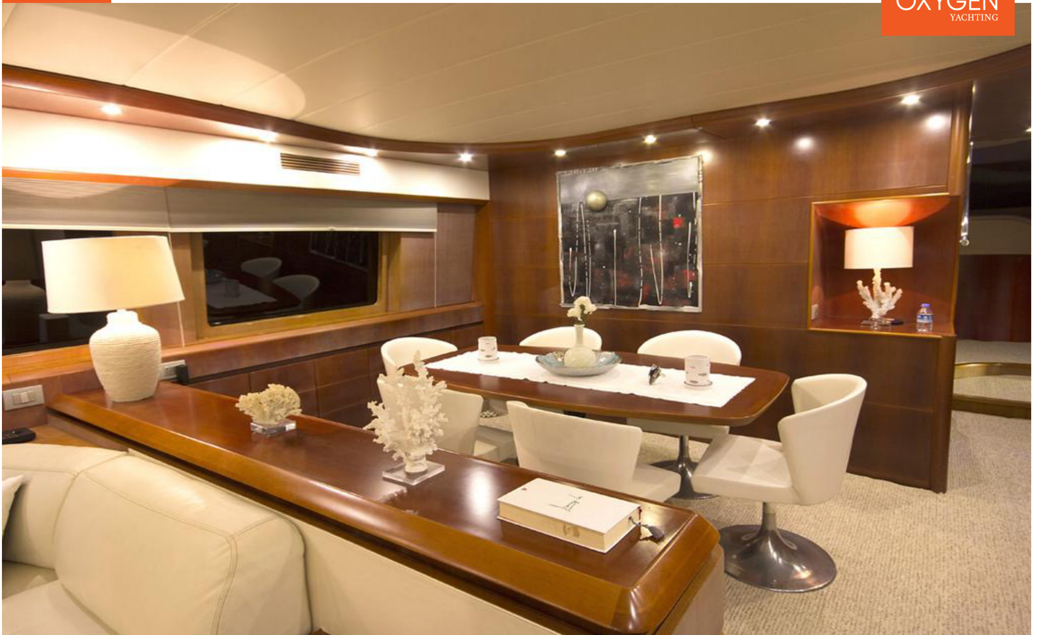
MOTOR YACHT | 26m | 2003 (Refit 2018)