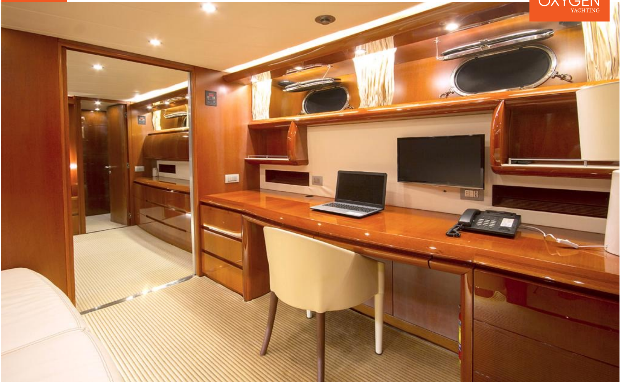
MOTOR YACHT | 26m | 2003 (Refit 2018)