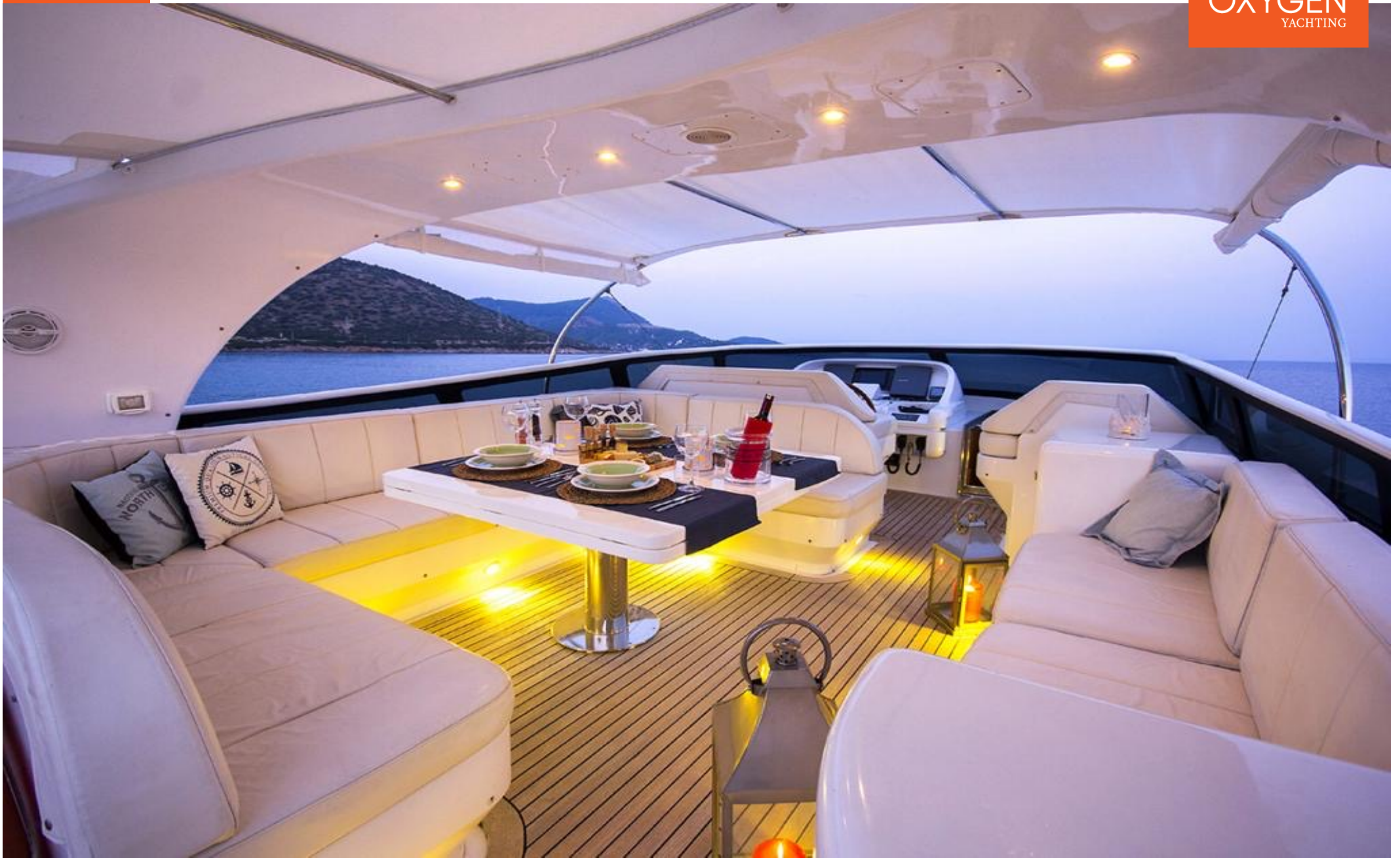
MOTOR YACHT | 26m | 2003 (Refit 2018)