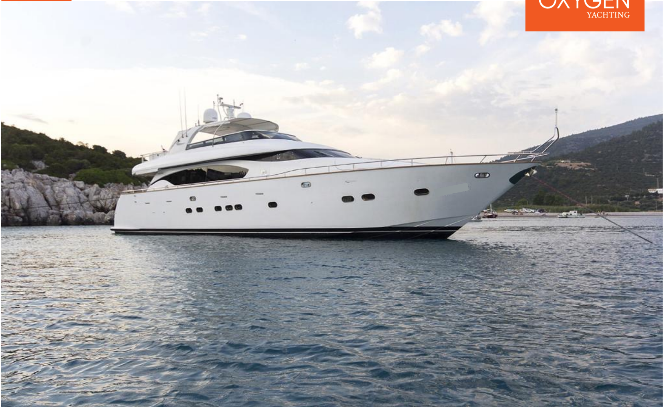
MOTOR YACHT | 26m | 2003 (Refit 2018)