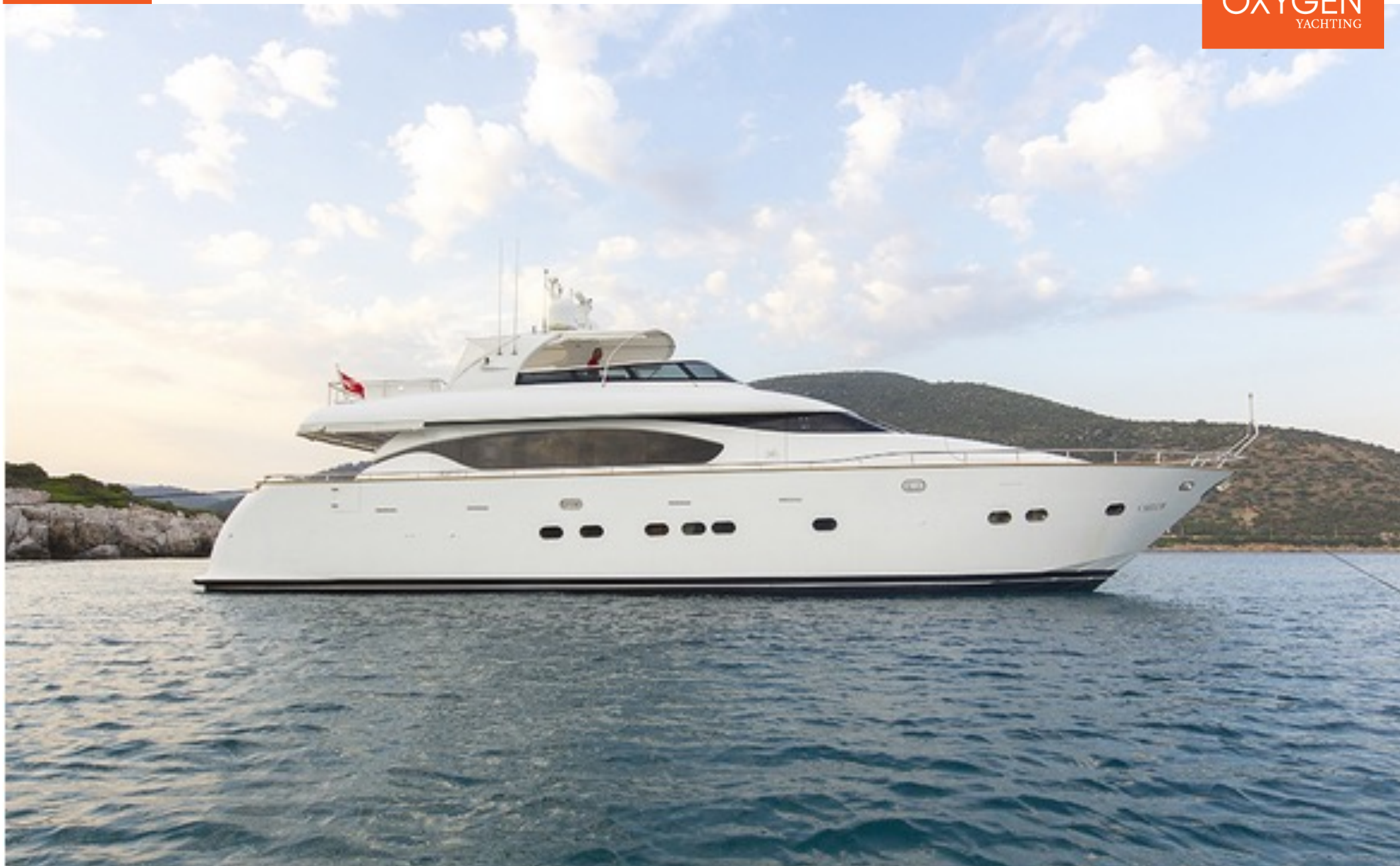
MOTOR YACHT | 26m | 2003 (Refit 2018)