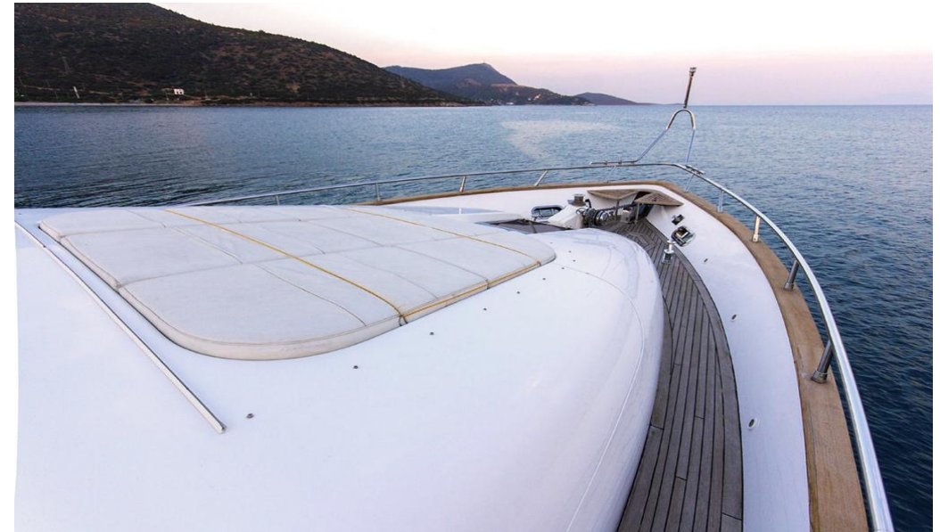
MOTOR YACHT | 26m | 2003 (Refit 2018)