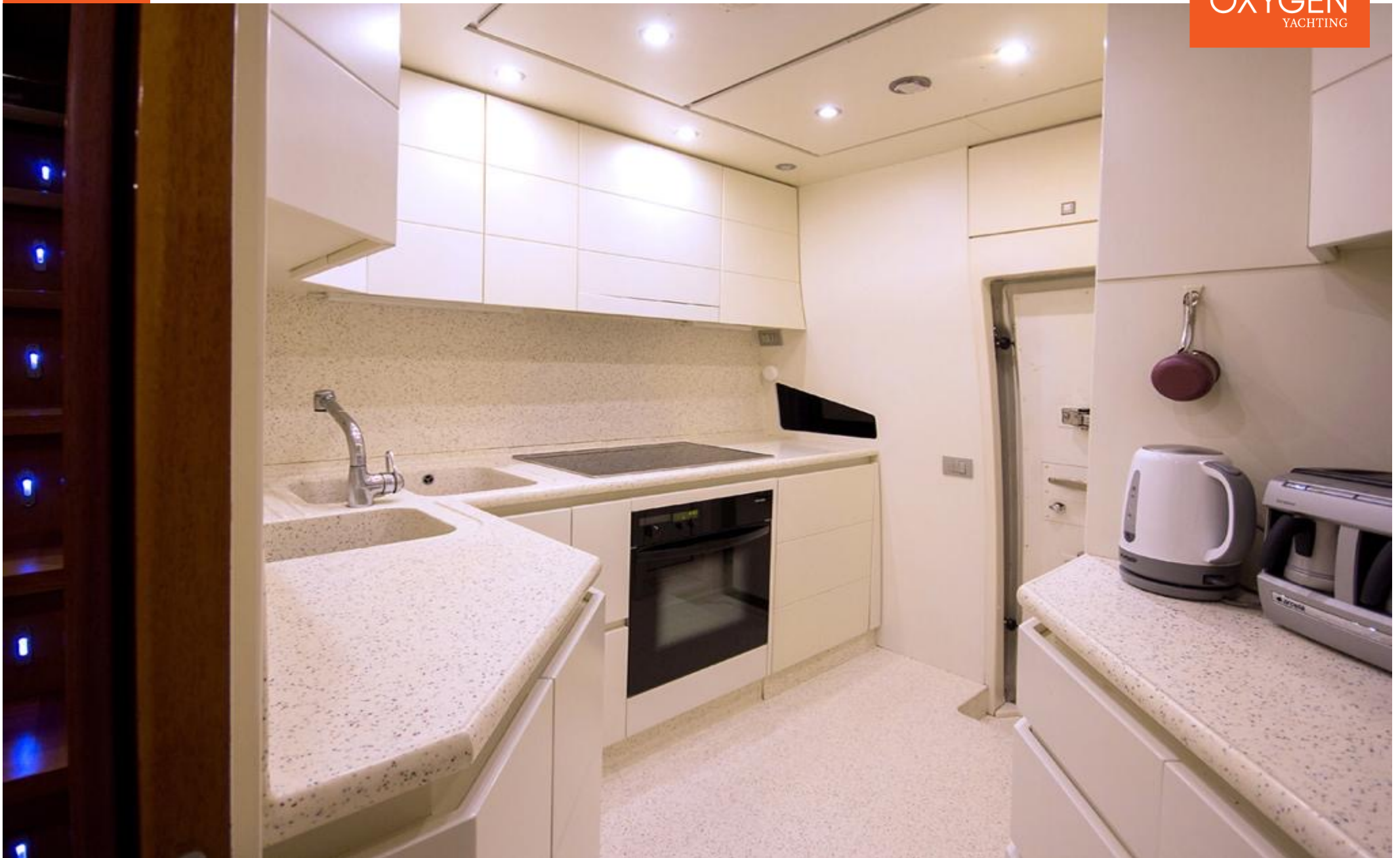
MOTOR YACHT | 26m | 2003 (Refit 2018)