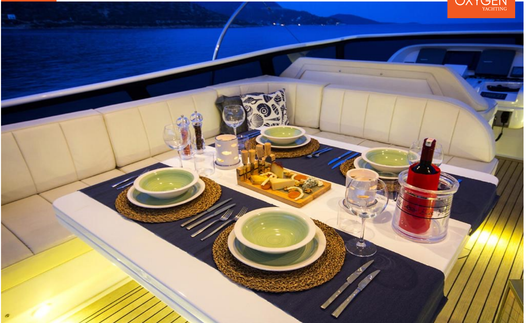
MOTOR YACHT | 26m | 2003 (Refit 2018)