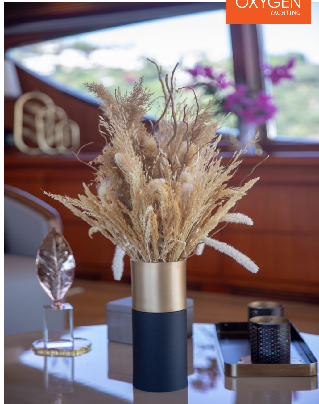
MOTOR YACHT | 30m | 2003 | (Refit 2020)