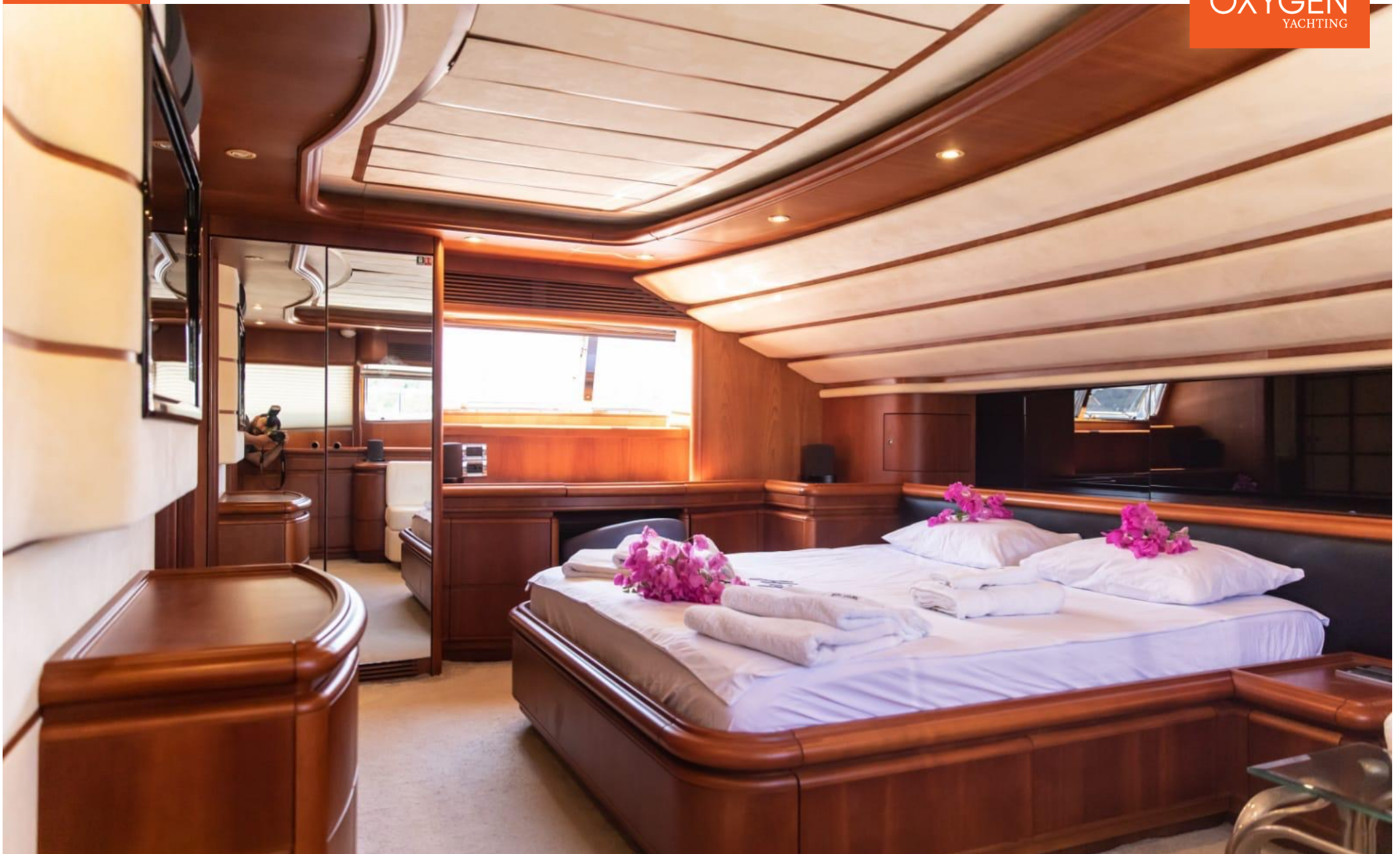
MOTOR YACHT | 30m | 2003 | (Refit 2020)