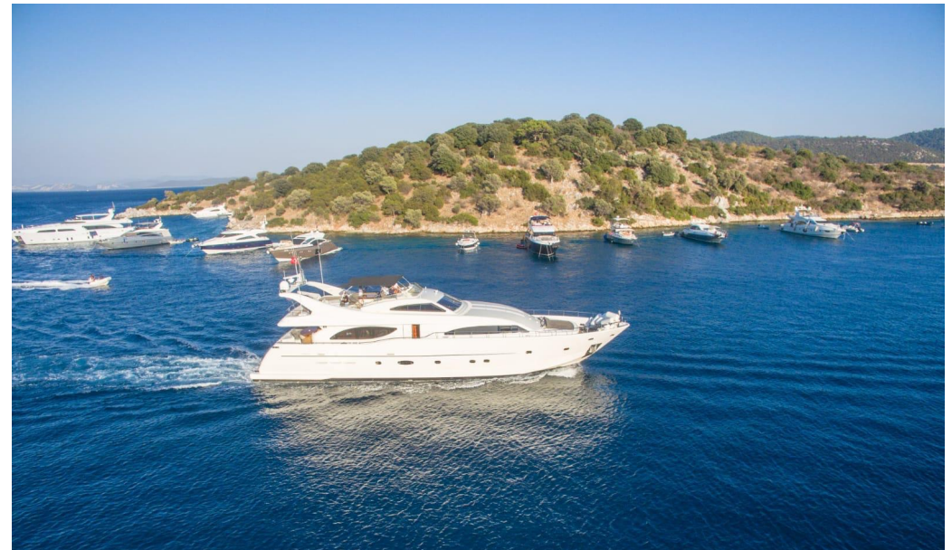
MOTOR YACHT | 30m | 2003 | (Refit 2020)