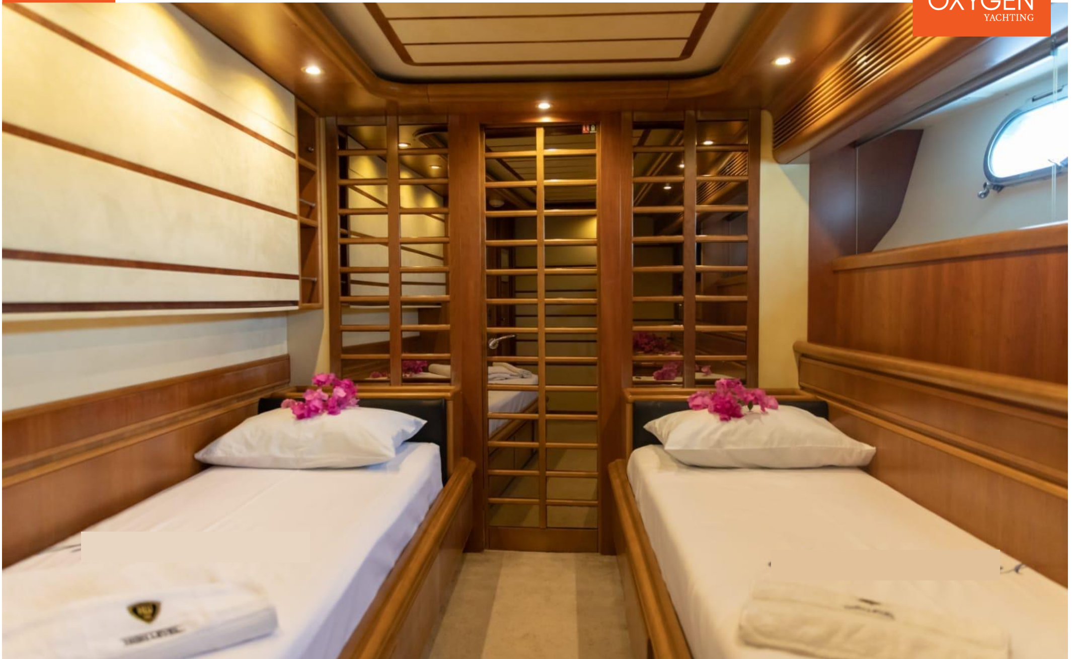
MOTOR YACHT | 30m | 2003 | (Refit 2020)