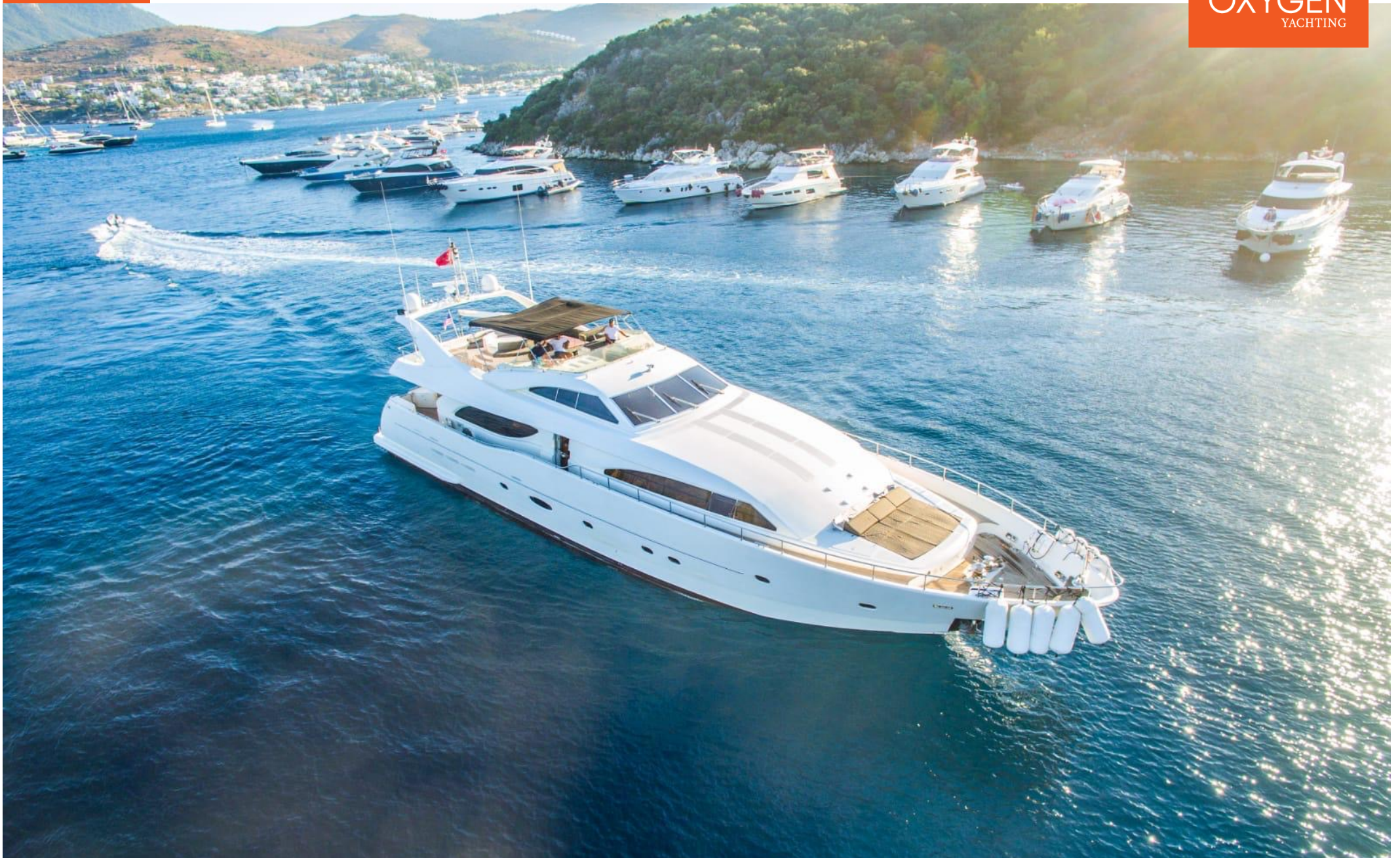
MOTOR YACHT | 30m | 2003 | (Refit 2020)