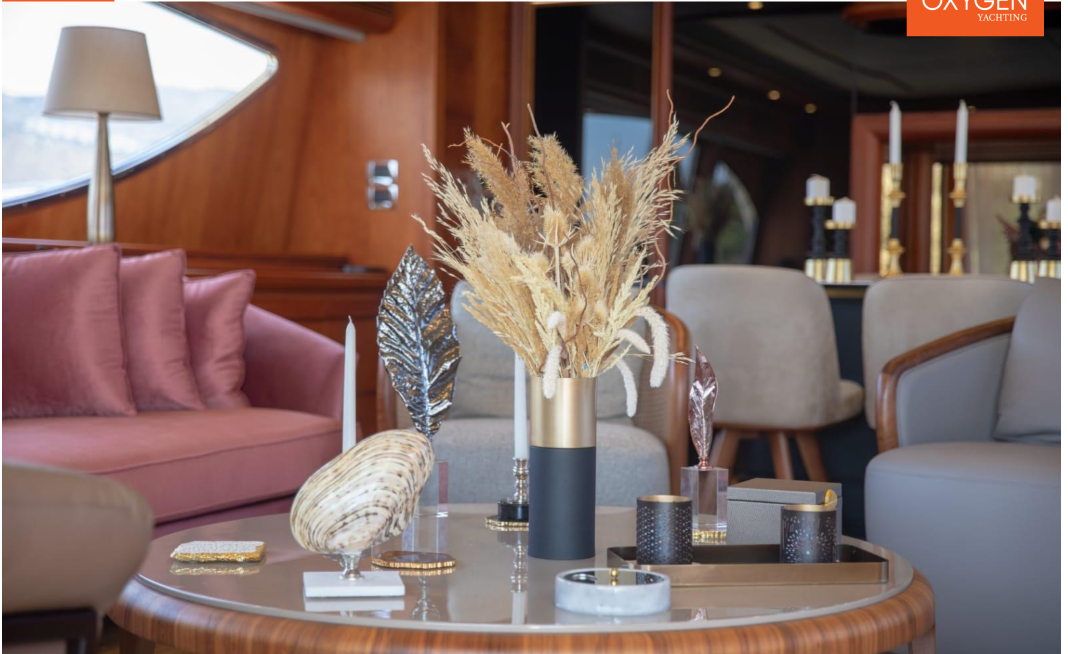
MOTOR YACHT | 30m | 2003 | (Refit 2020)