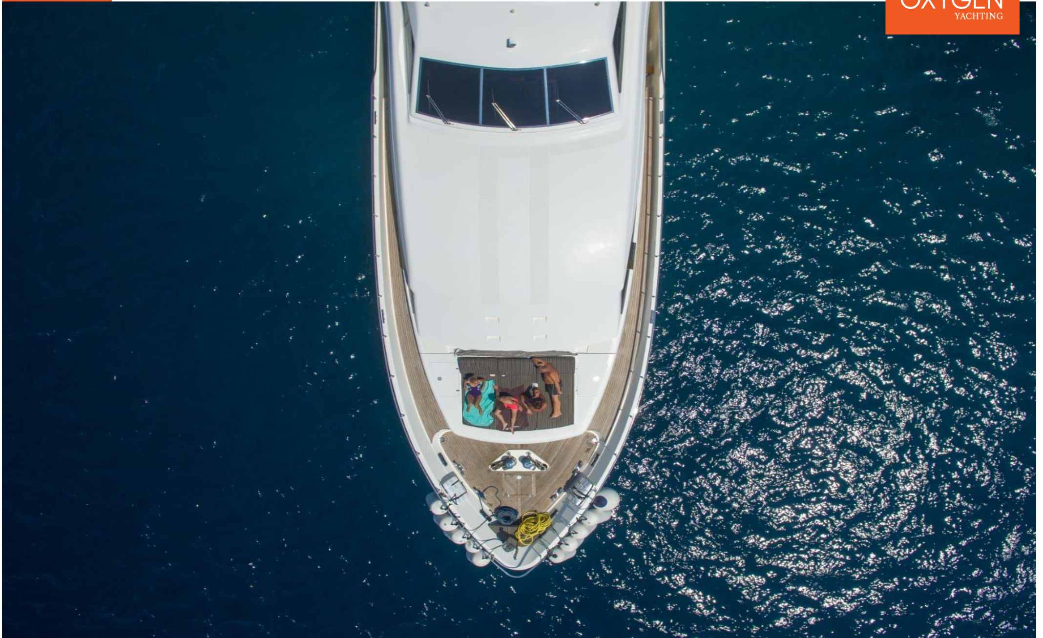
MOTOR YACHT | 30m | 2003 | (Refit 2020)