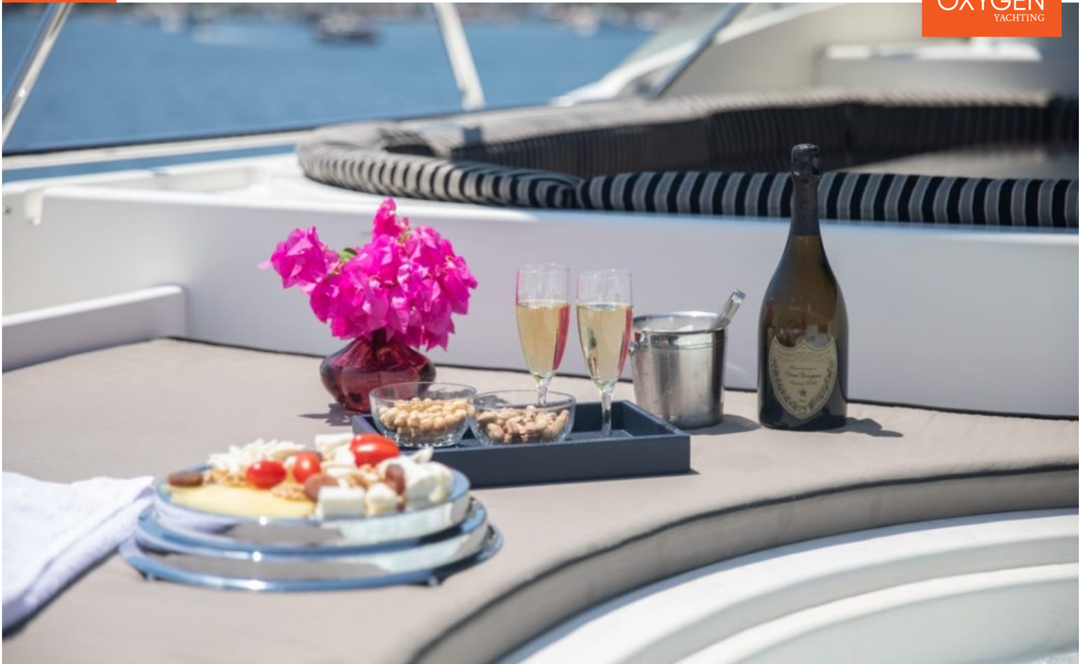
MOTOR YACHT | 30m | 2003 | (Refit 2020)