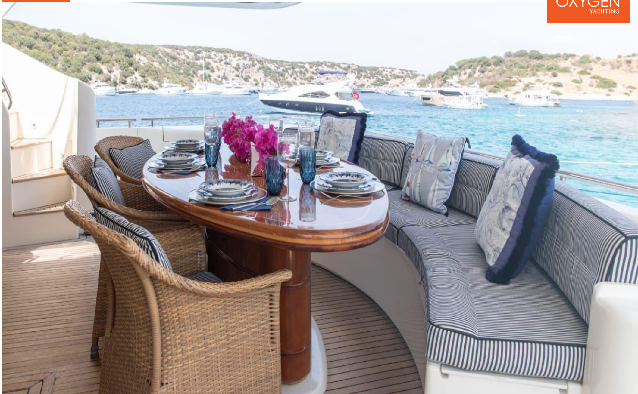
MOTOR YACHT | 30m | 2003 | (Refit 2020)