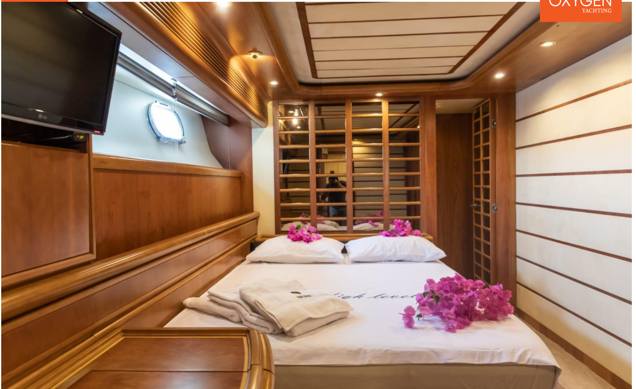
MOTOR YACHT | 30m | 2003 | (Refit 2020)