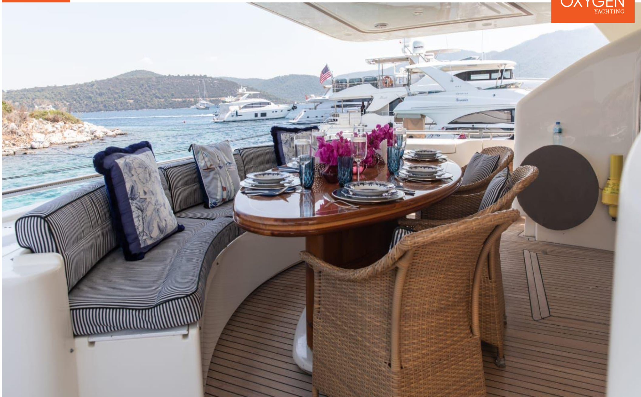
MOTOR YACHT | 30m | 2003 | (Refit 2020)