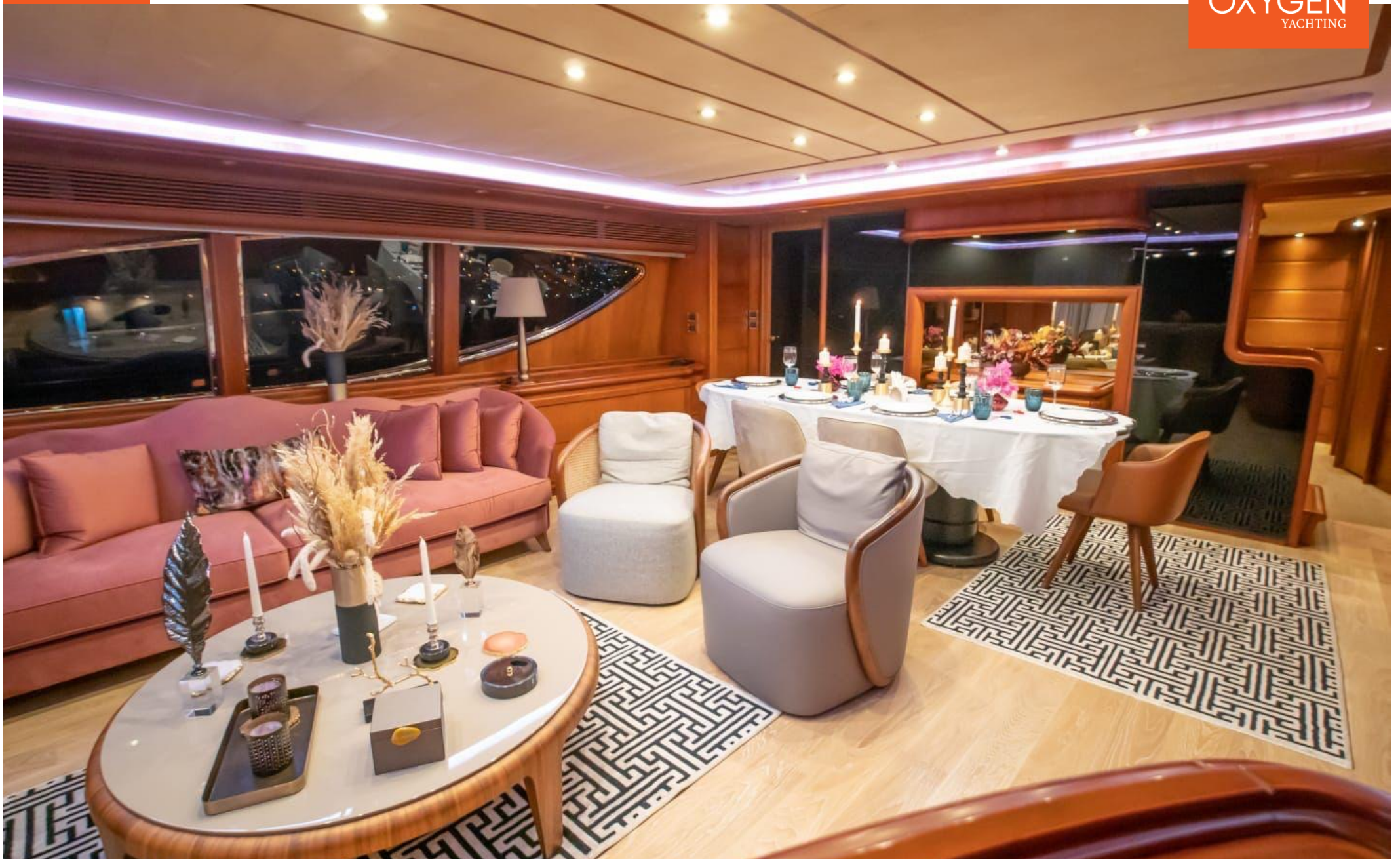
MOTOR YACHT | 30m | 2003 | (Refit 2020)