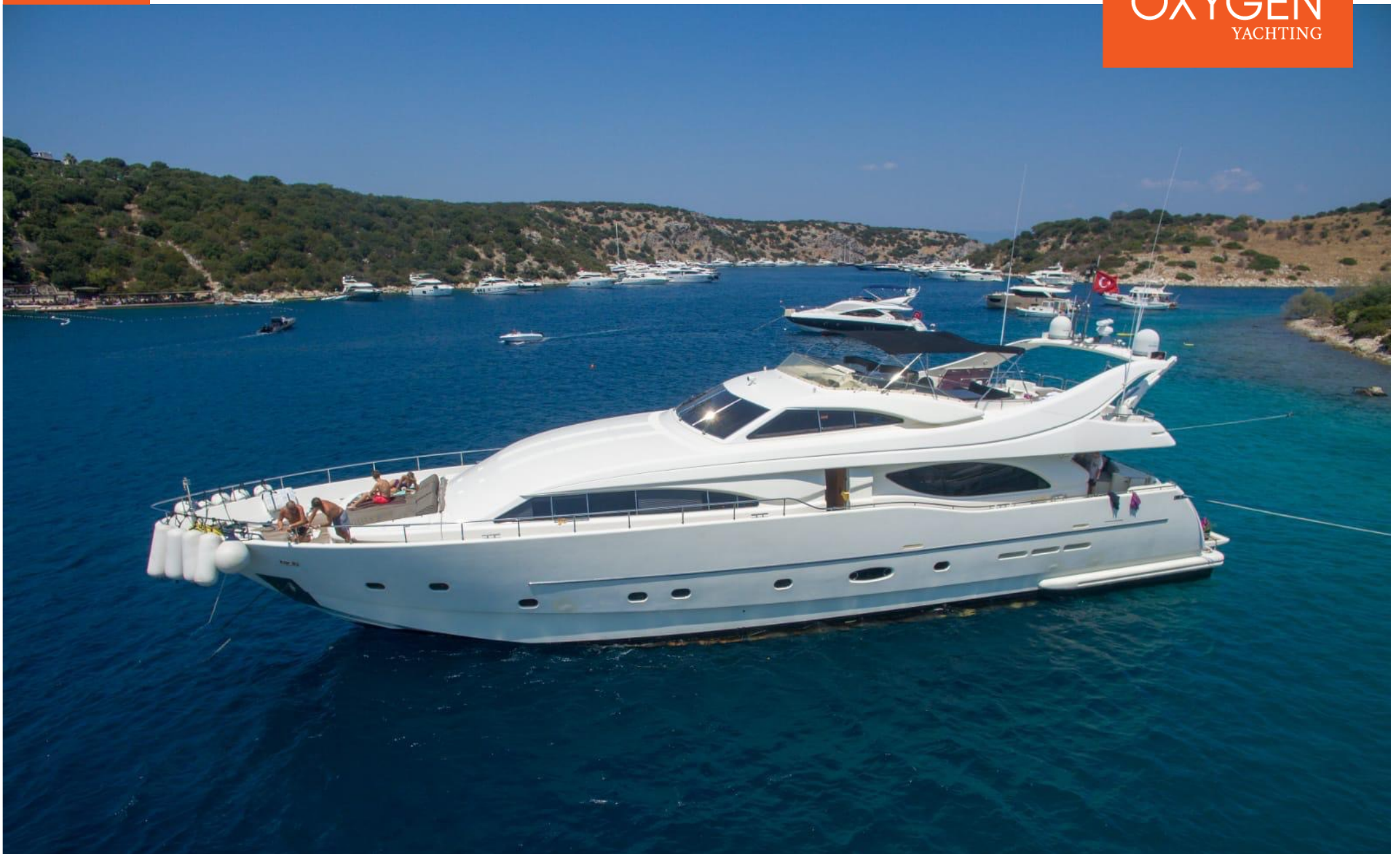
MOTOR YACHT | 30m | 2003 | (Refit 2020)