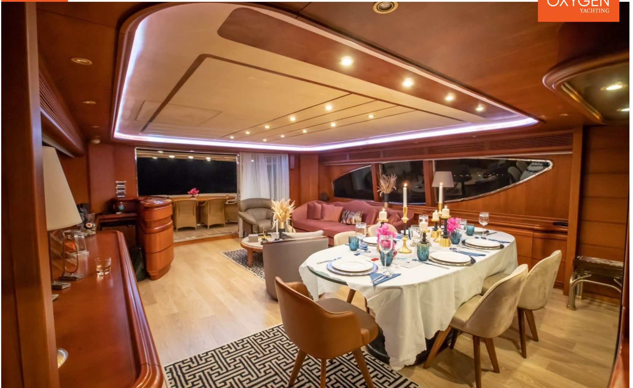
MOTOR YACHT | 30m | 2003 | (Refit 2020)