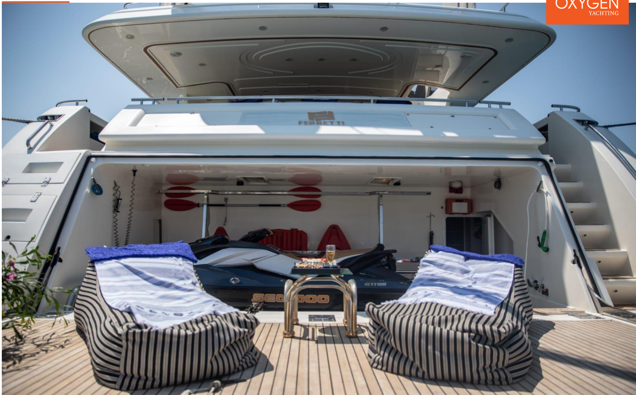
MOTOR YACHT | 30m | 2003 | (Refit 2020)