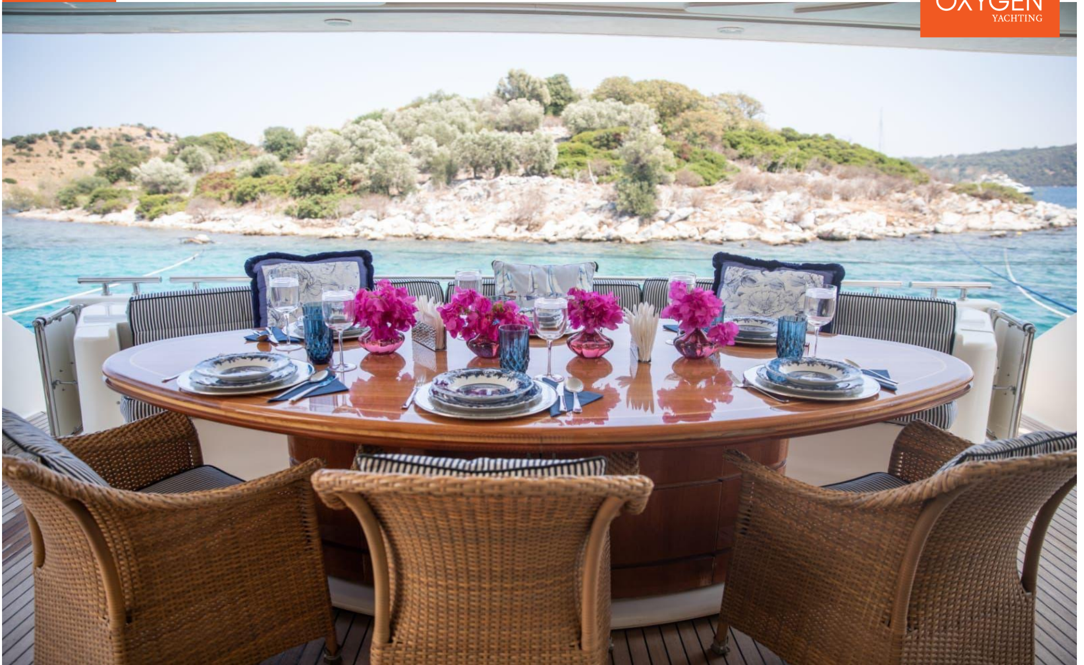
MOTOR YACHT | 30m | 2003 | (Refit 2020)