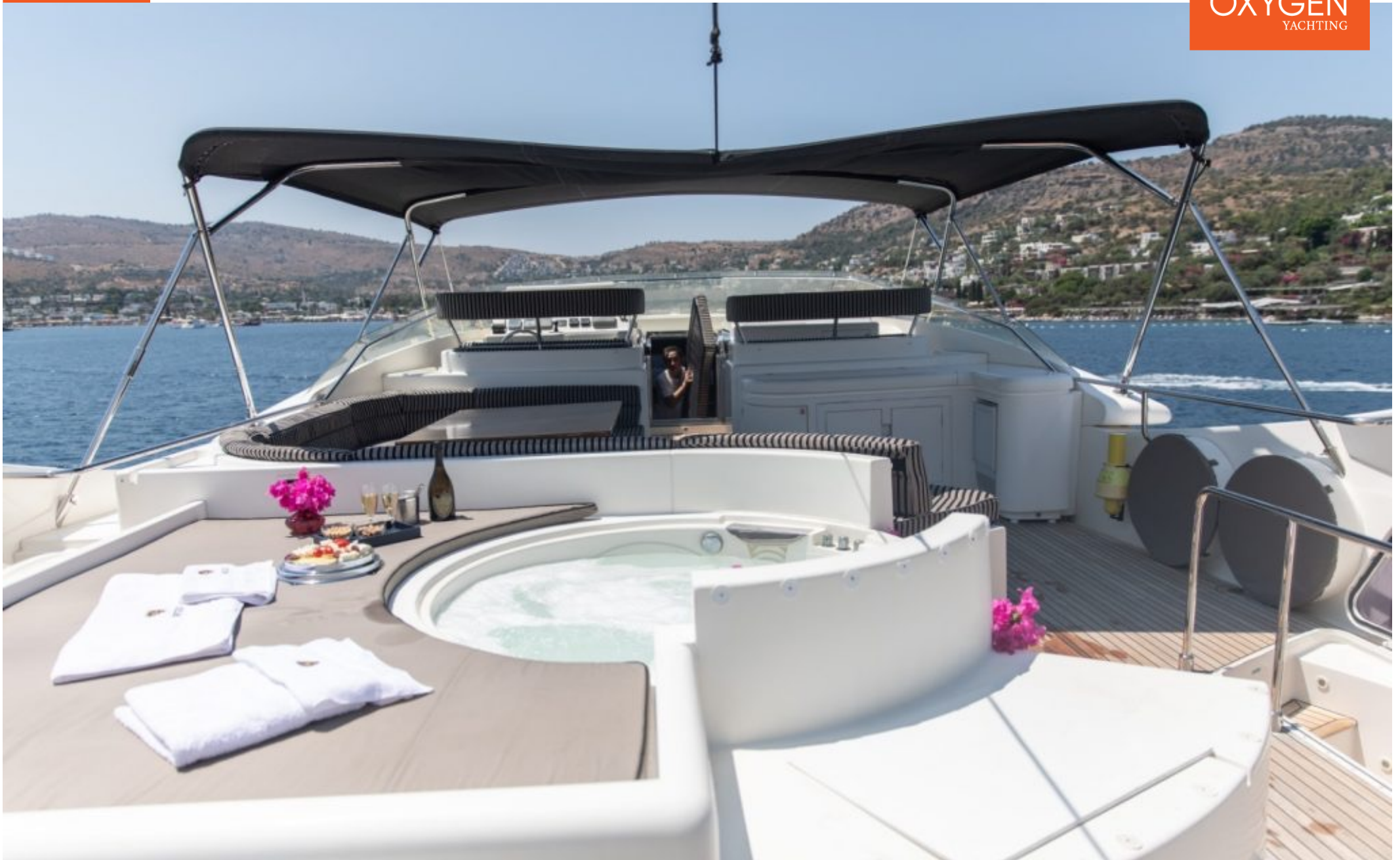
MOTOR YACHT | 30m | 2003 | (Refit 2020)