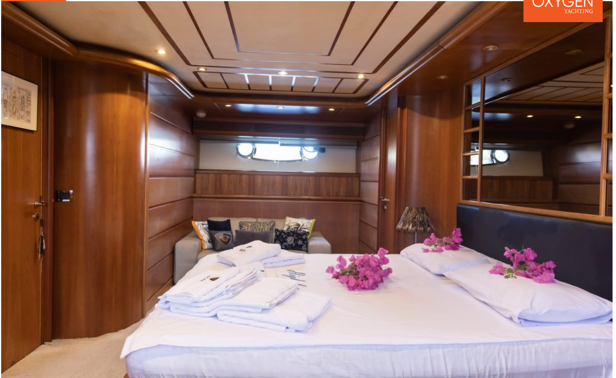
MOTOR YACHT | 30m | 2003 | (Refit 2020)