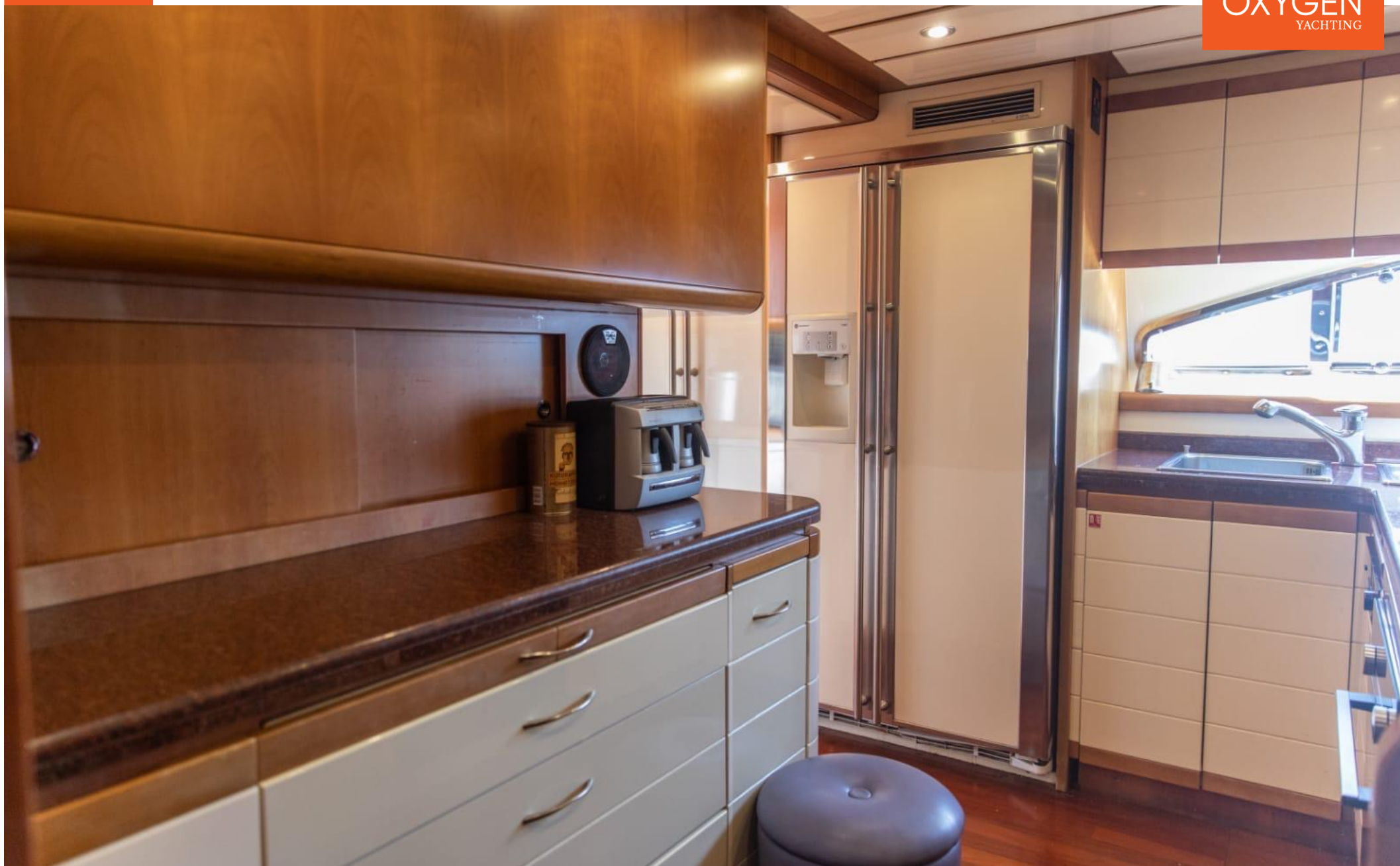
MOTOR YACHT | 30m | 2003 | (Refit 2020)