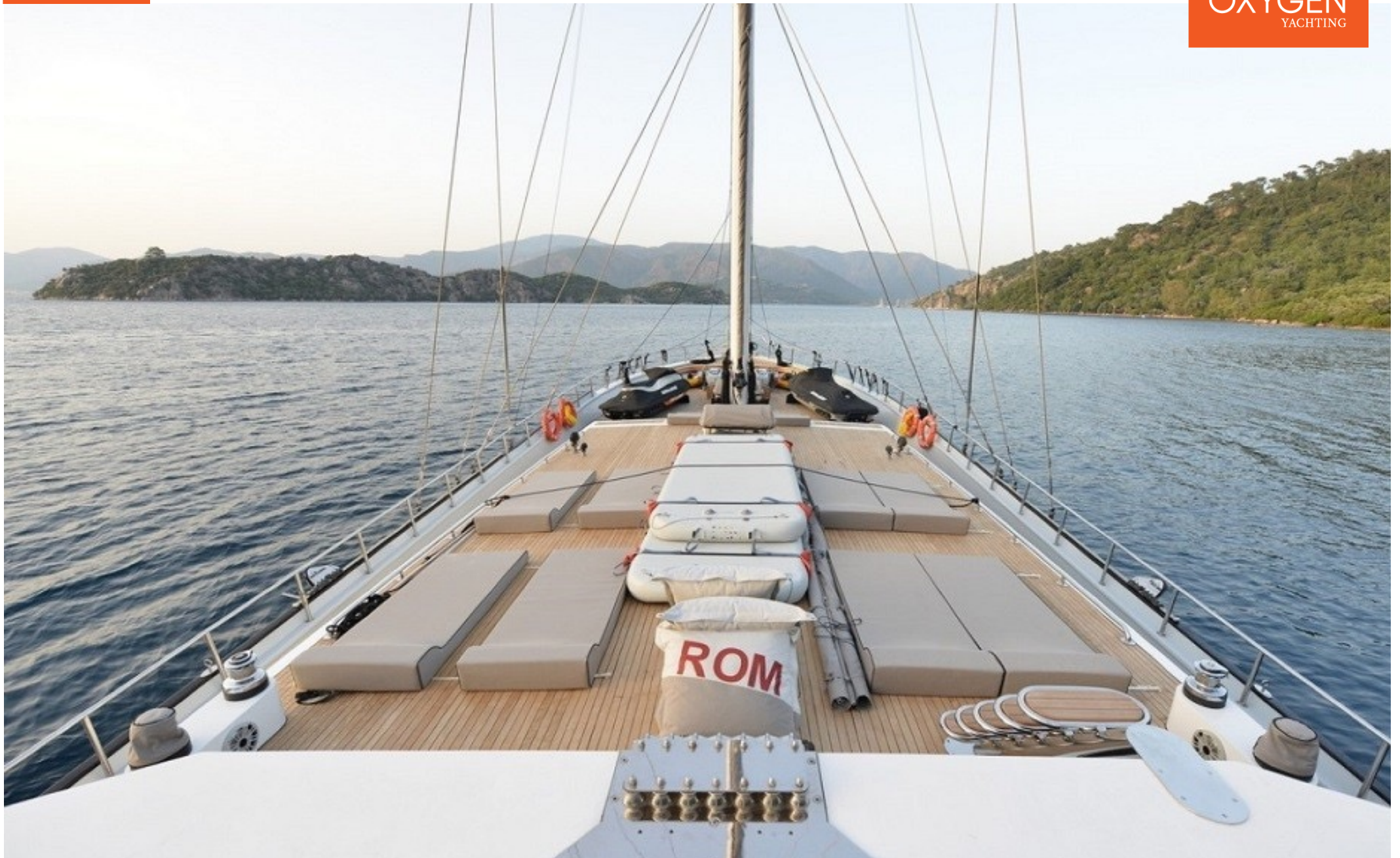
GULET | 38m | 2007 (Refit 2016)