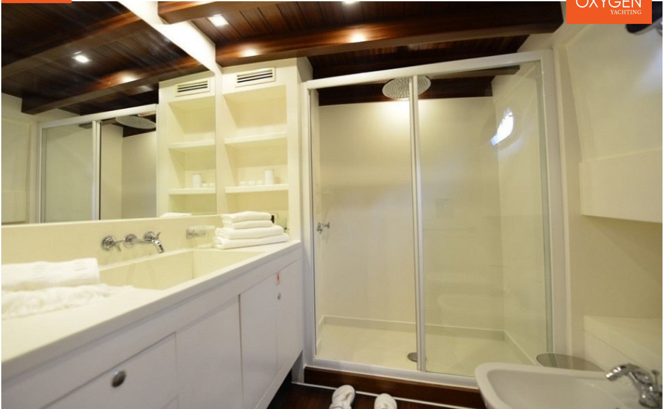
GULET | 38m | 2007 (Refit 2016)