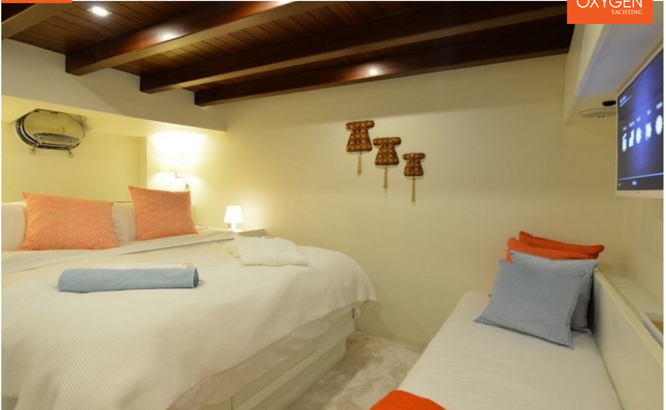
GULET | 38m | 2007 (Refit 2016)