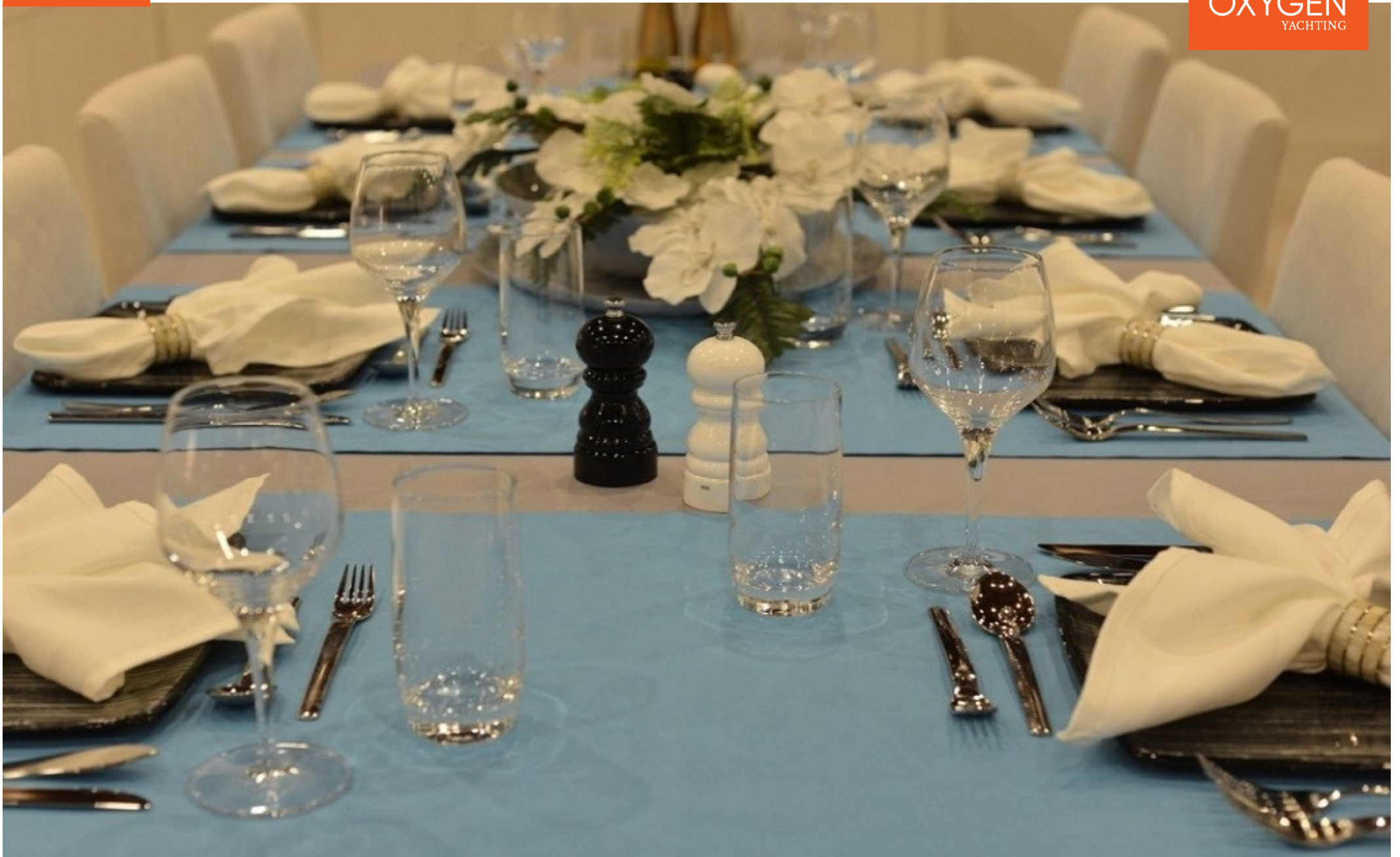
GULET | 38m | 2007 (Refit 2016)