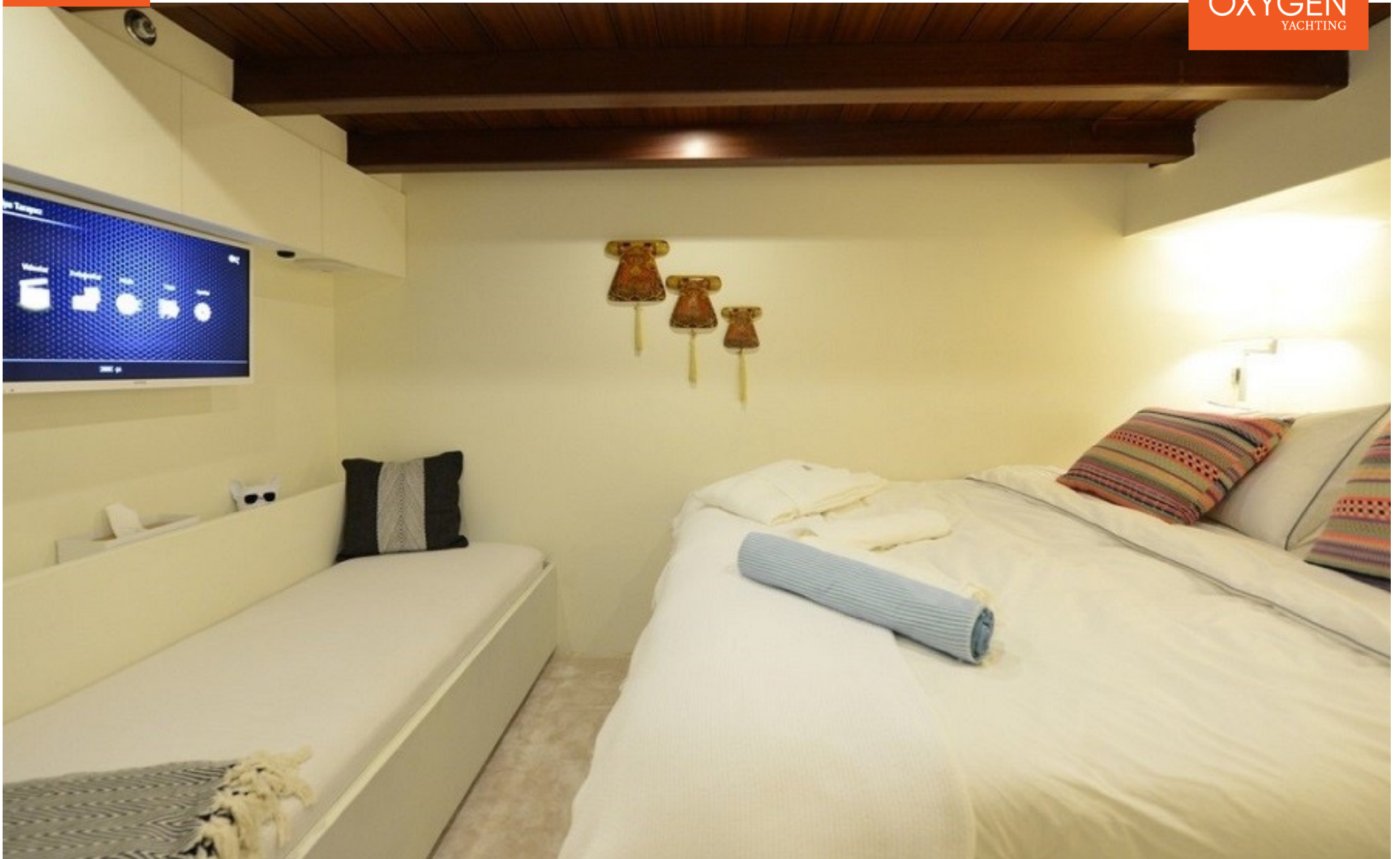
GULET | 38m | 2007 (Refit 2016)