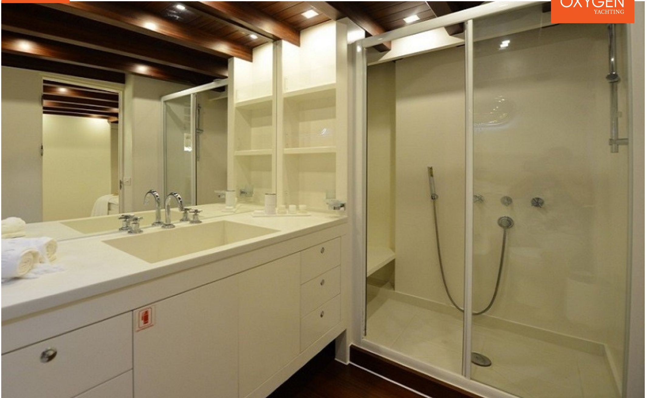
GULET | 38m | 2007 (Refit 2016)