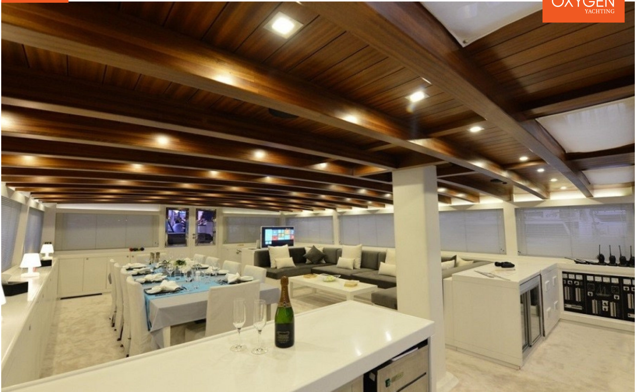
GULET | 38m | 2007 (Refit 2016)