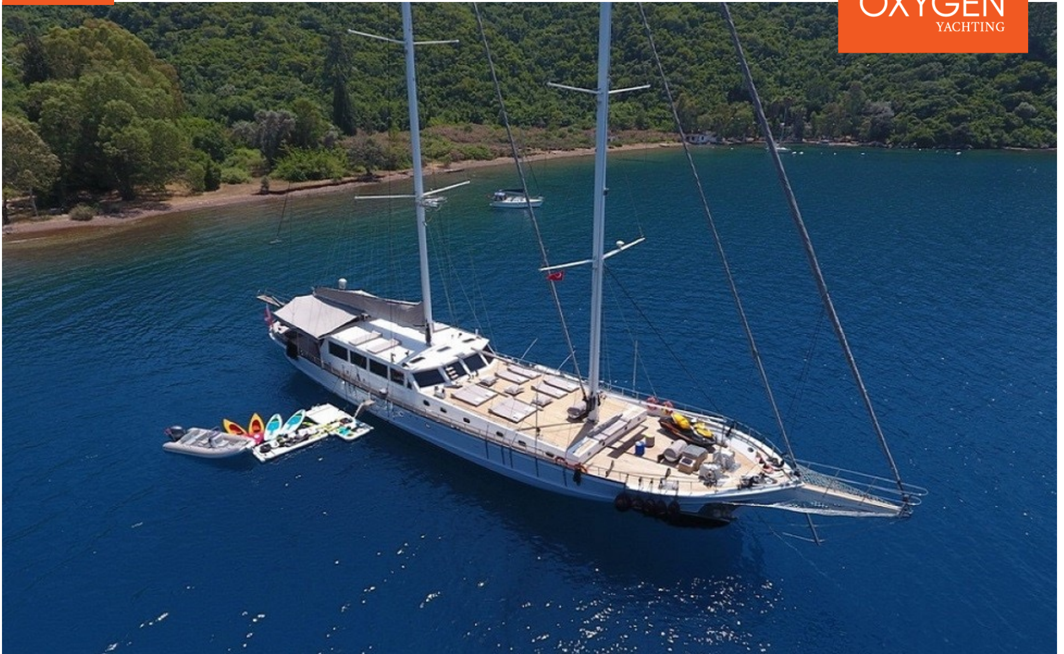
GULET | 38m | 2007 (Refit 2016)