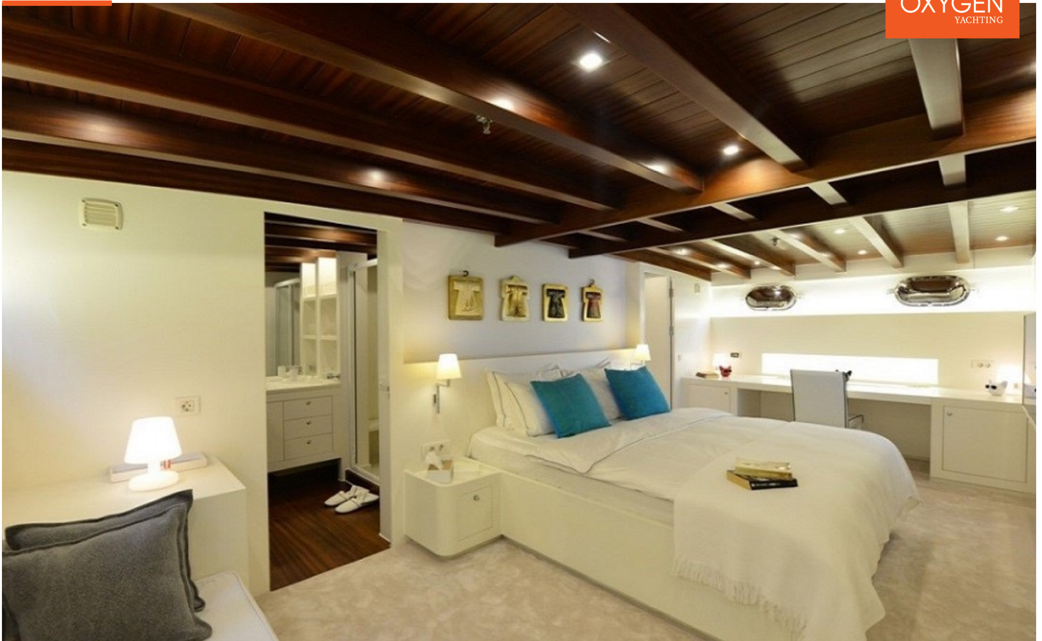
GULET | 38m | 2007 (Refit 2016)