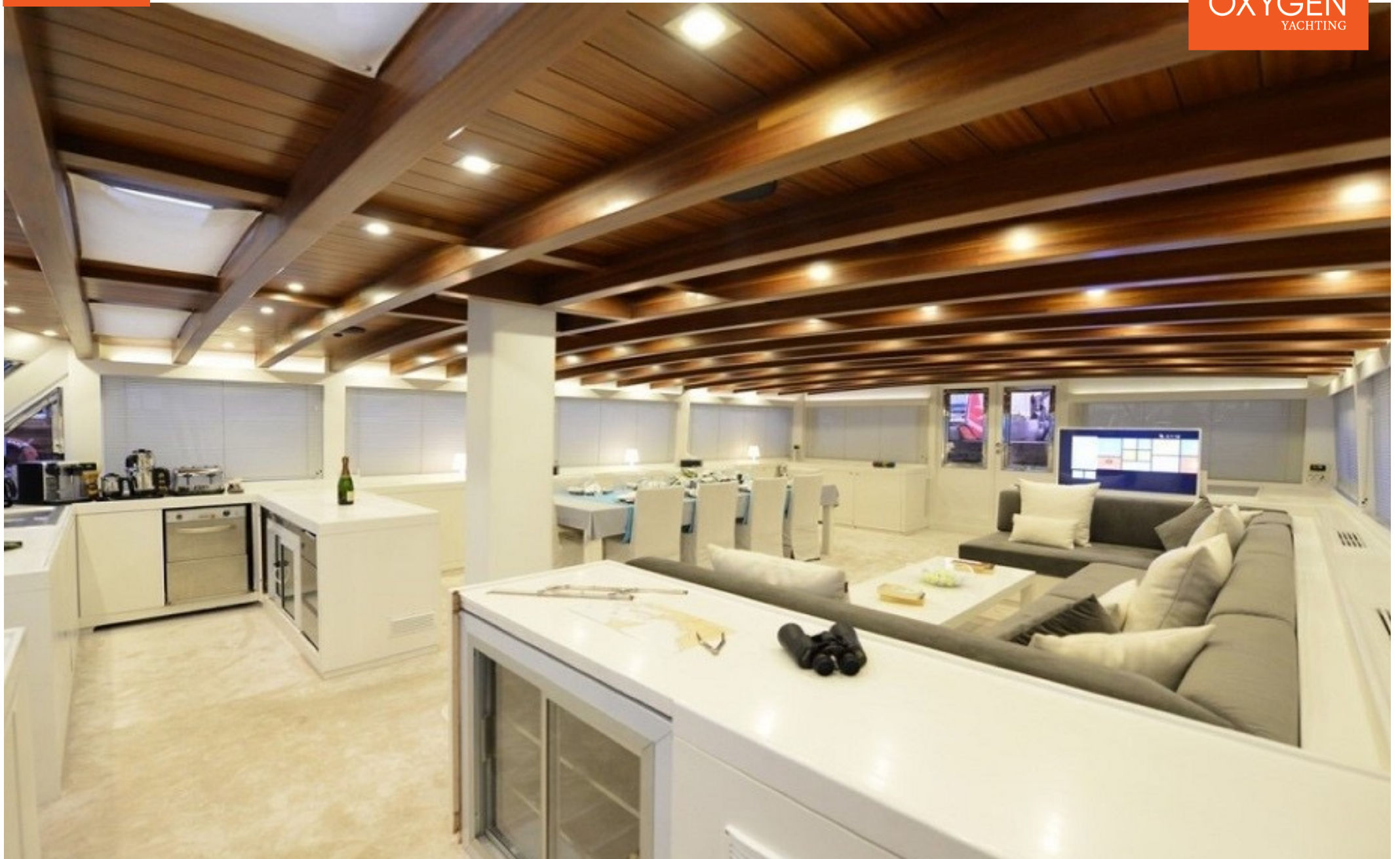
GULET | 38m | 2007 (Refit 2016)