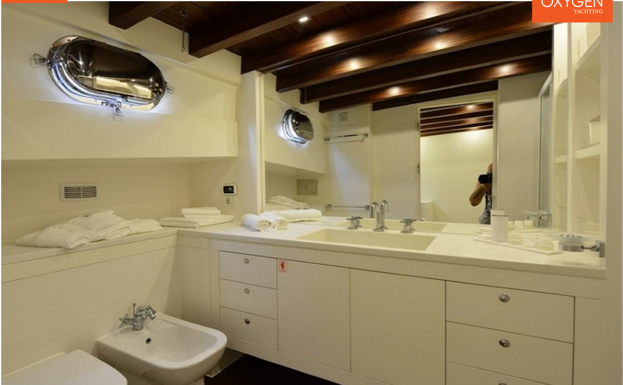
GULET | 38m | 2007 (Refit 2016)