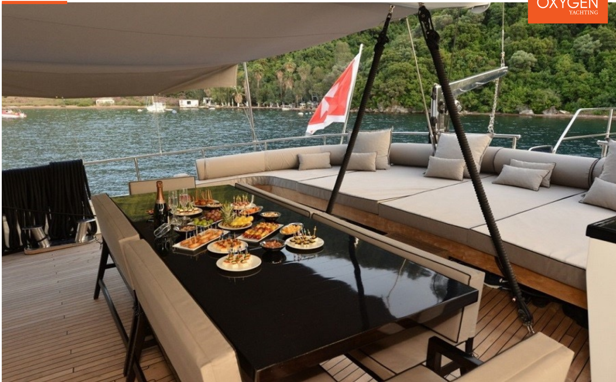
GULET | 38m | 2007 (Refit 2016)