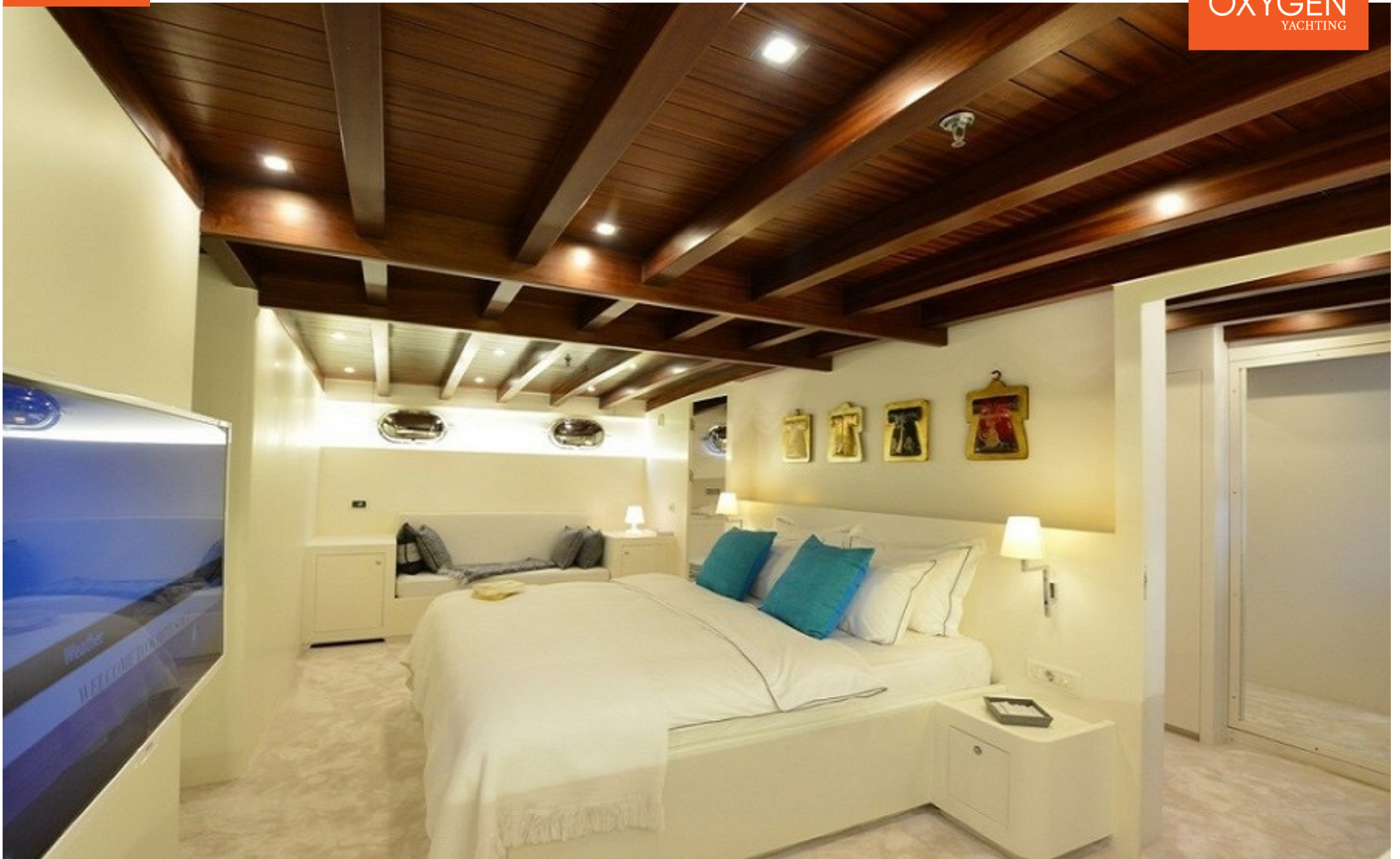
GULET | 38m | 2007 (Refit 2016)