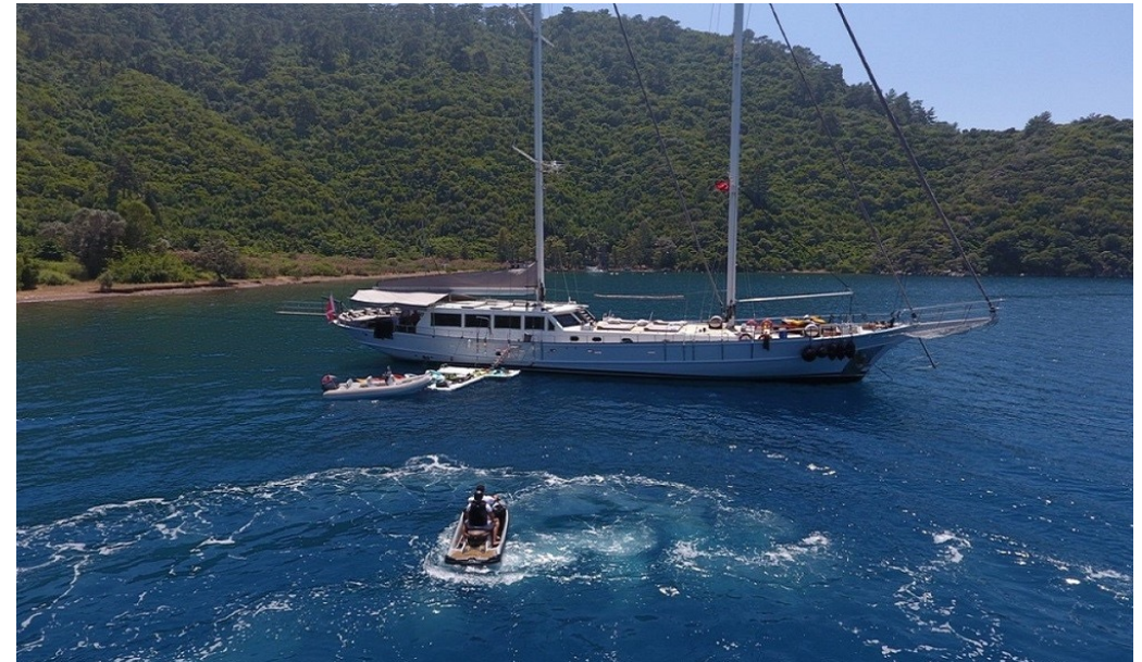
GULET | 38m | 2007 (Refit 2016)