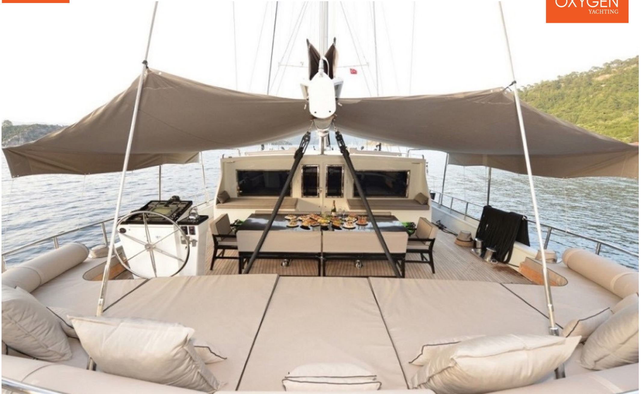
GULET | 38m | 2007 (Refit 2016)