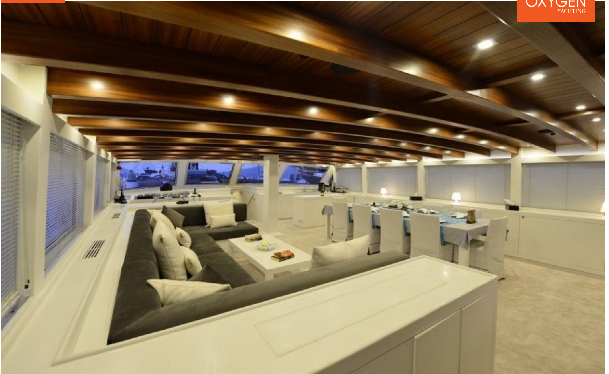
GULET | 38m | 2007 (Refit 2016)