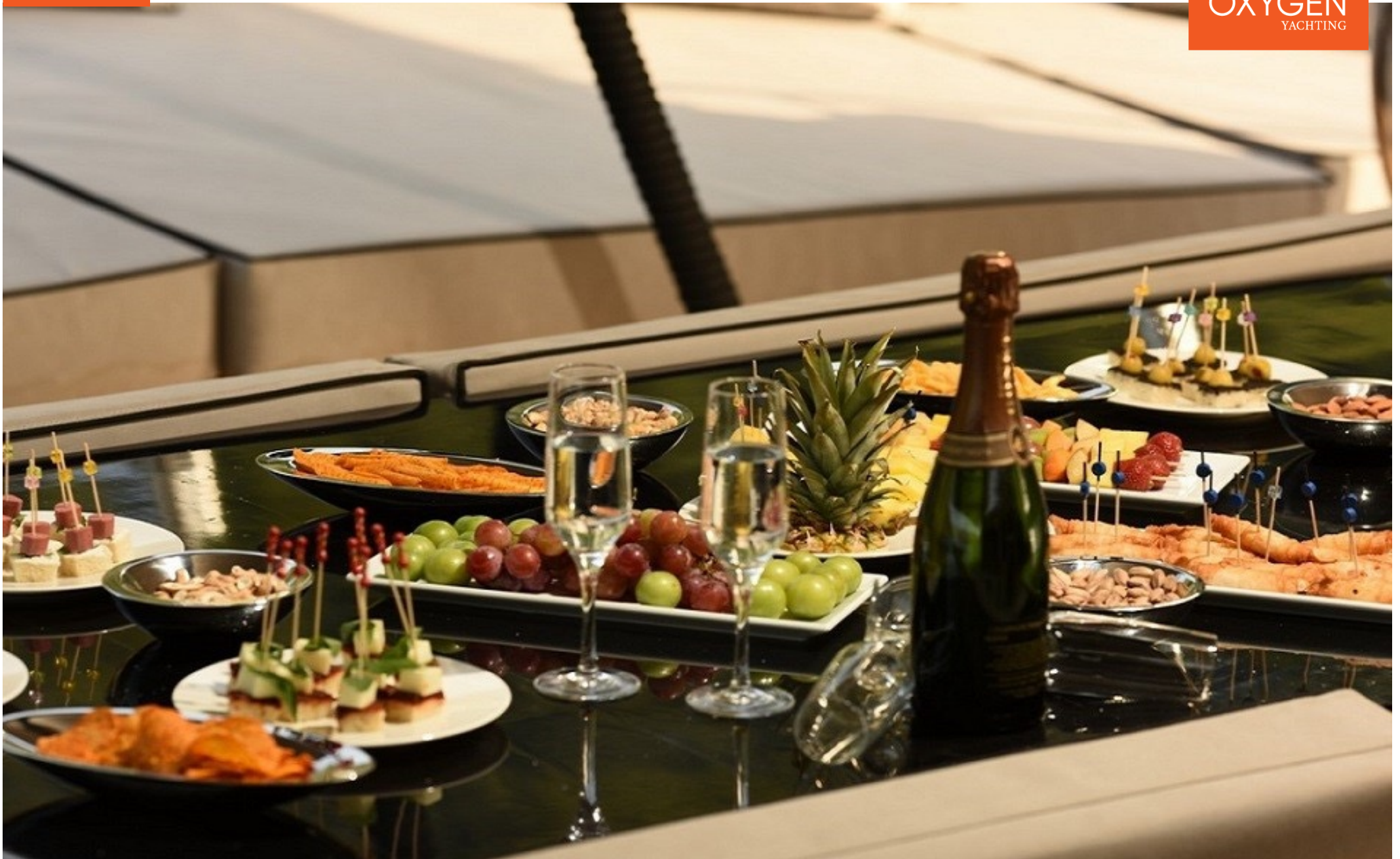
GULET | 38m | 2007 (Refit 2016)