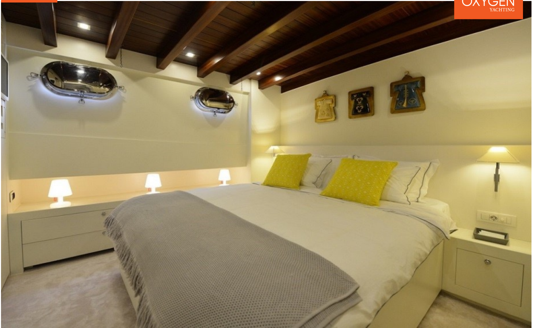
GULET | 38m | 2007 (Refit 2016)