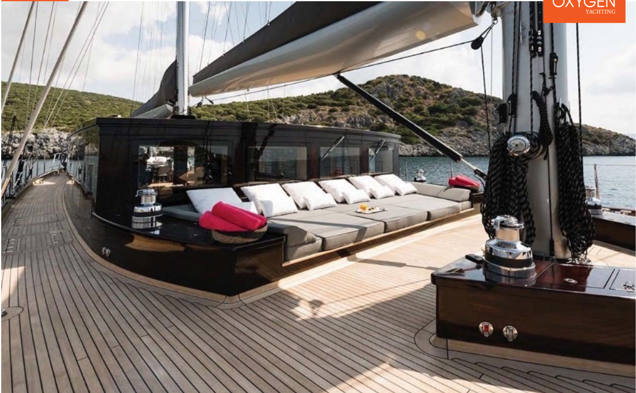
40m | 2015