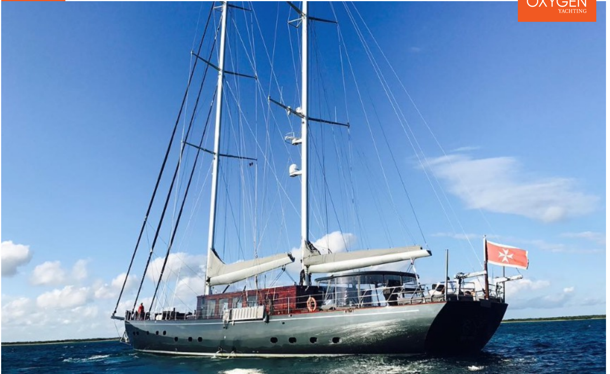
40m | 2015