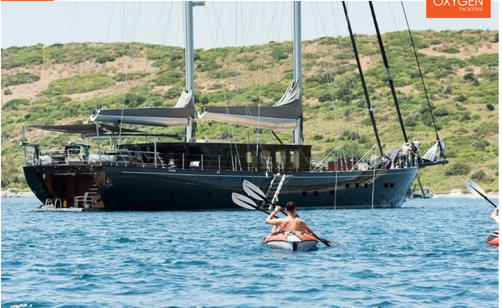
40m | 2015