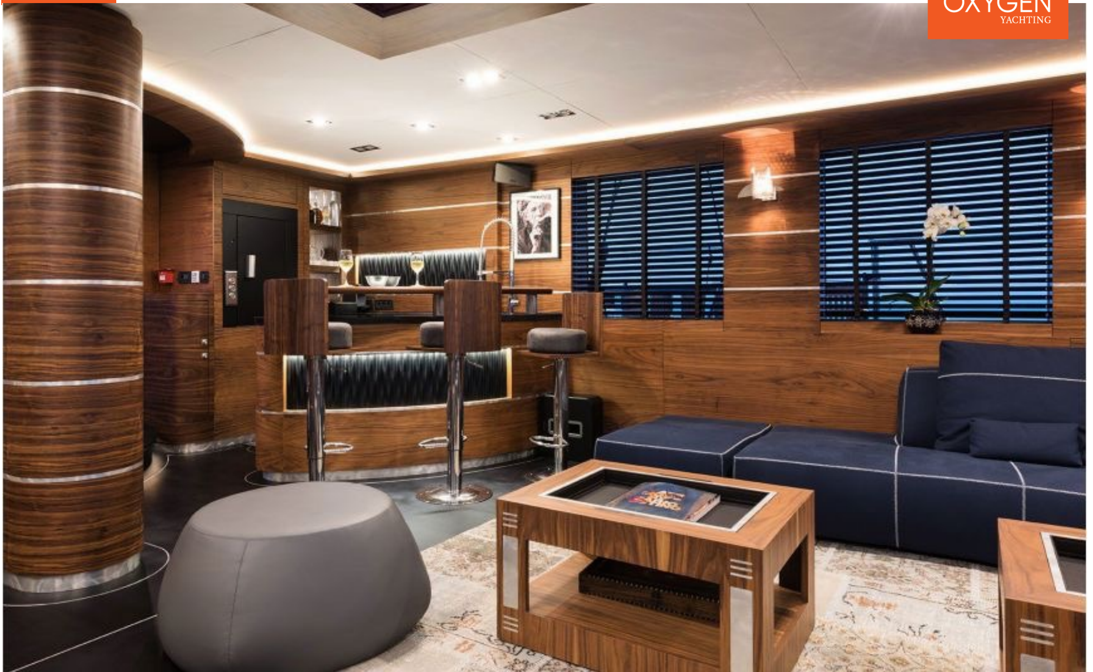
40m | 2015