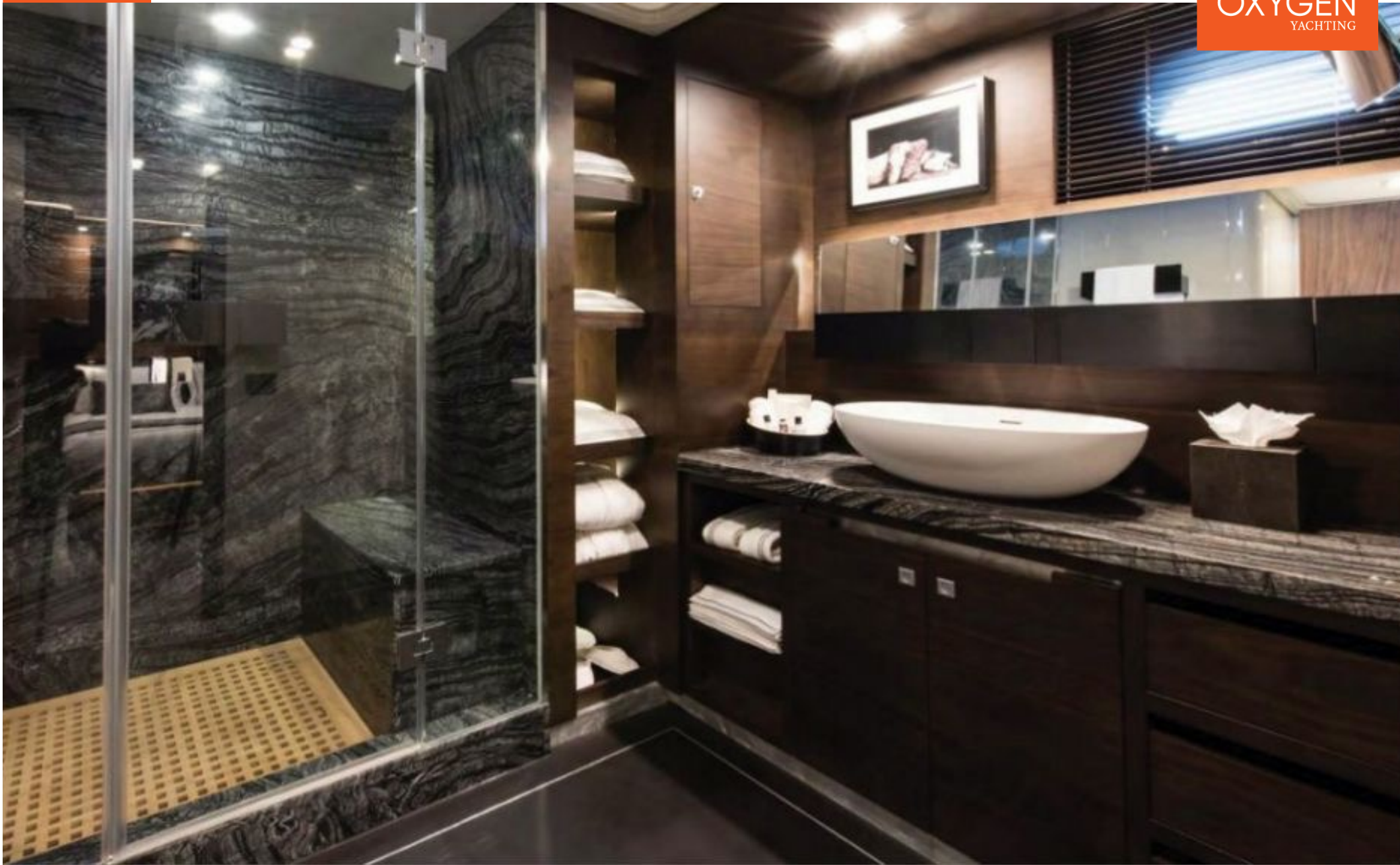
40m | 2015