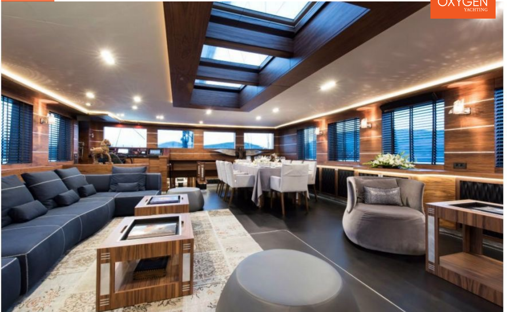
40m | 2015