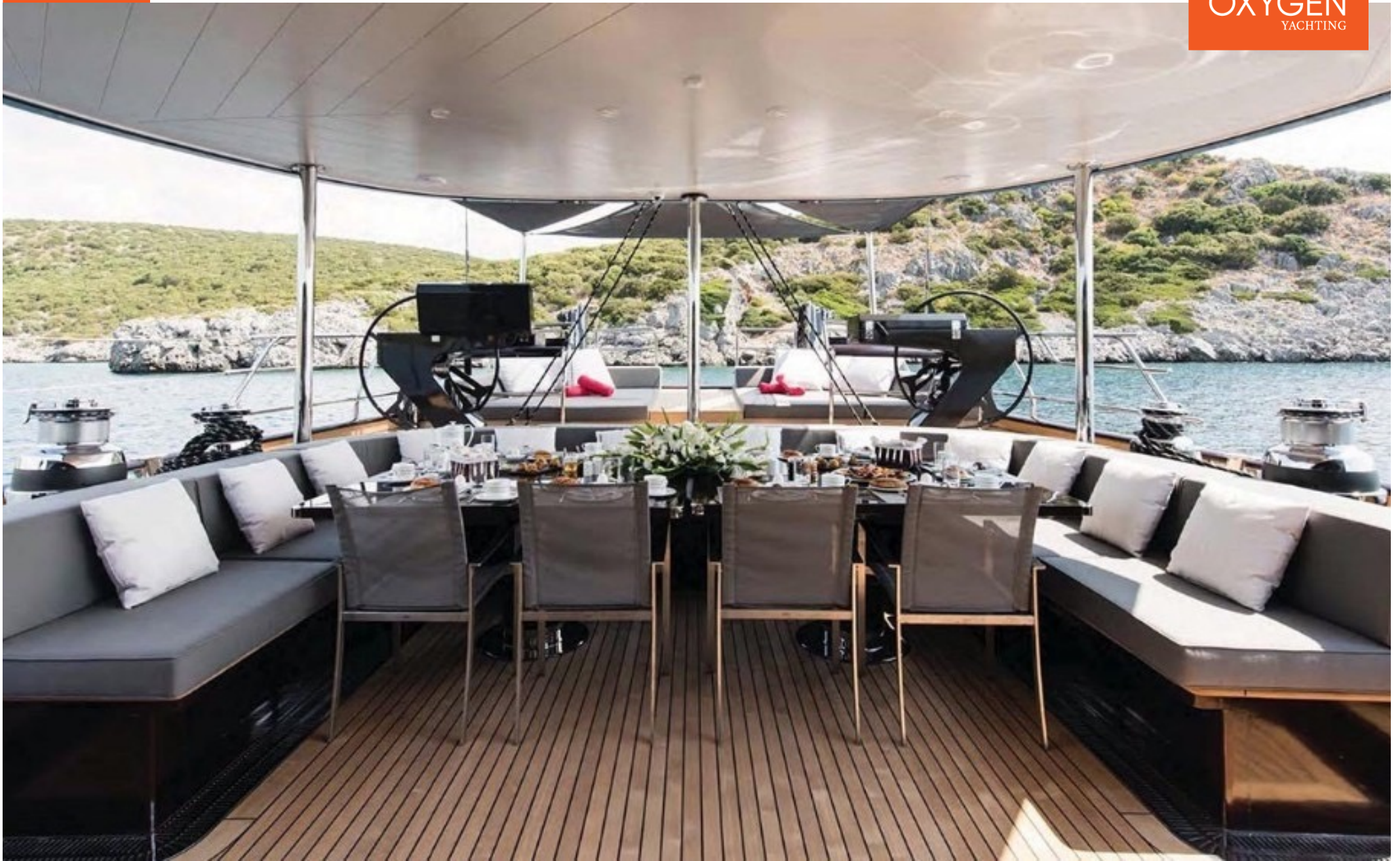
40m | 2015