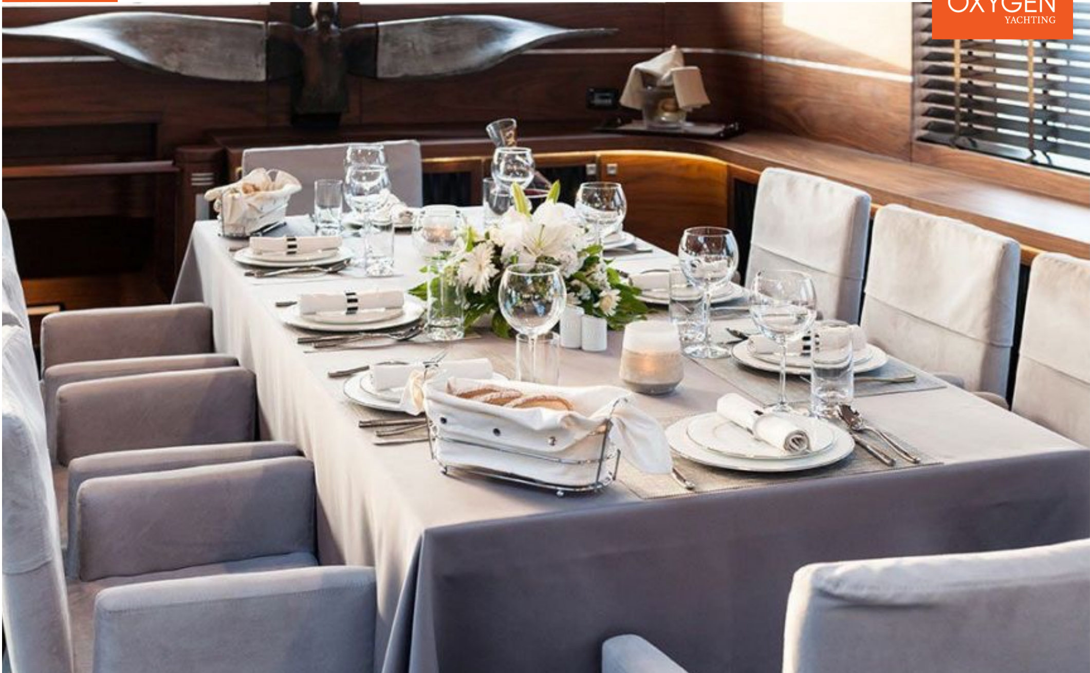
40m | 2015