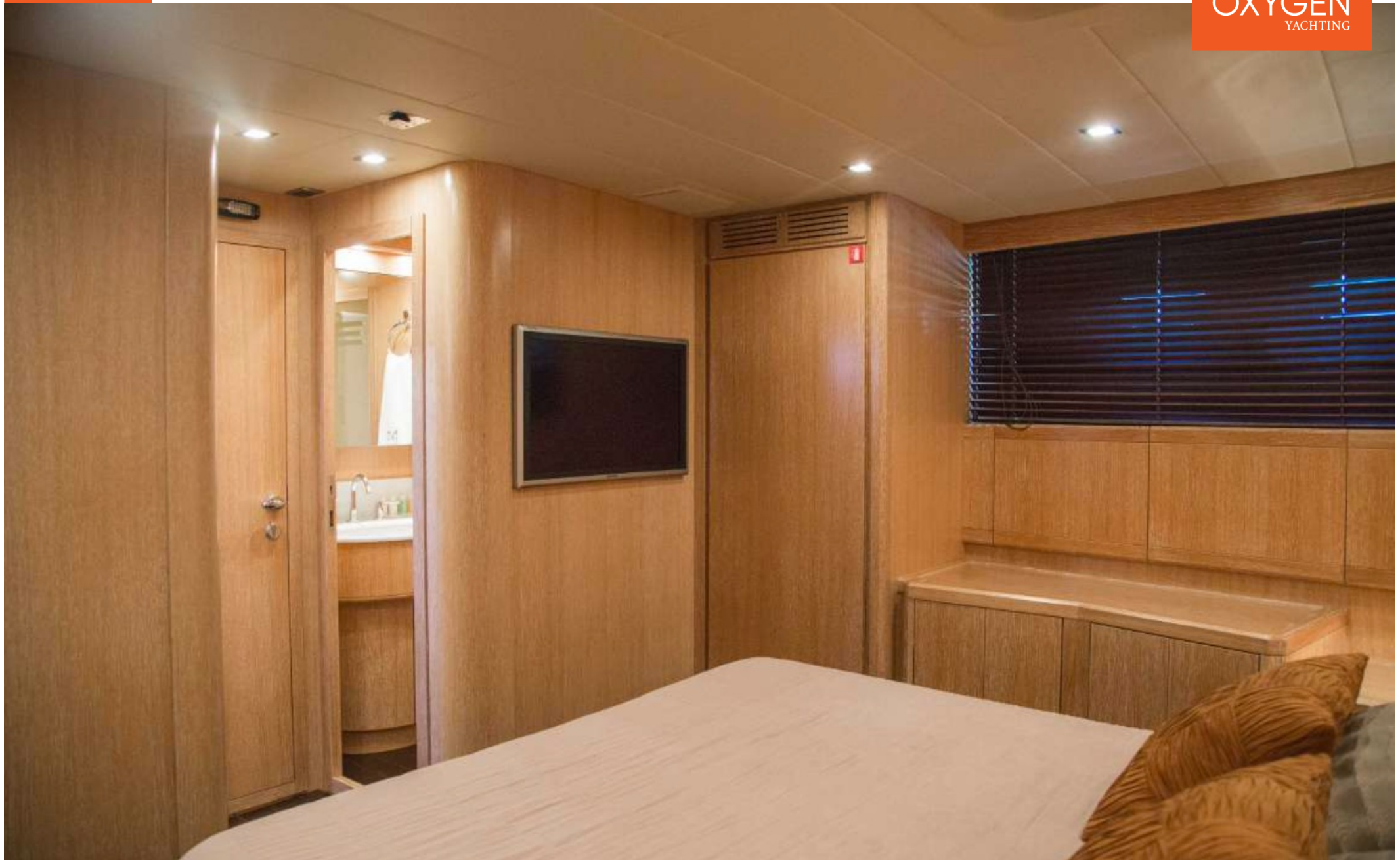
MANGUSTA 80 | 25m | 2005