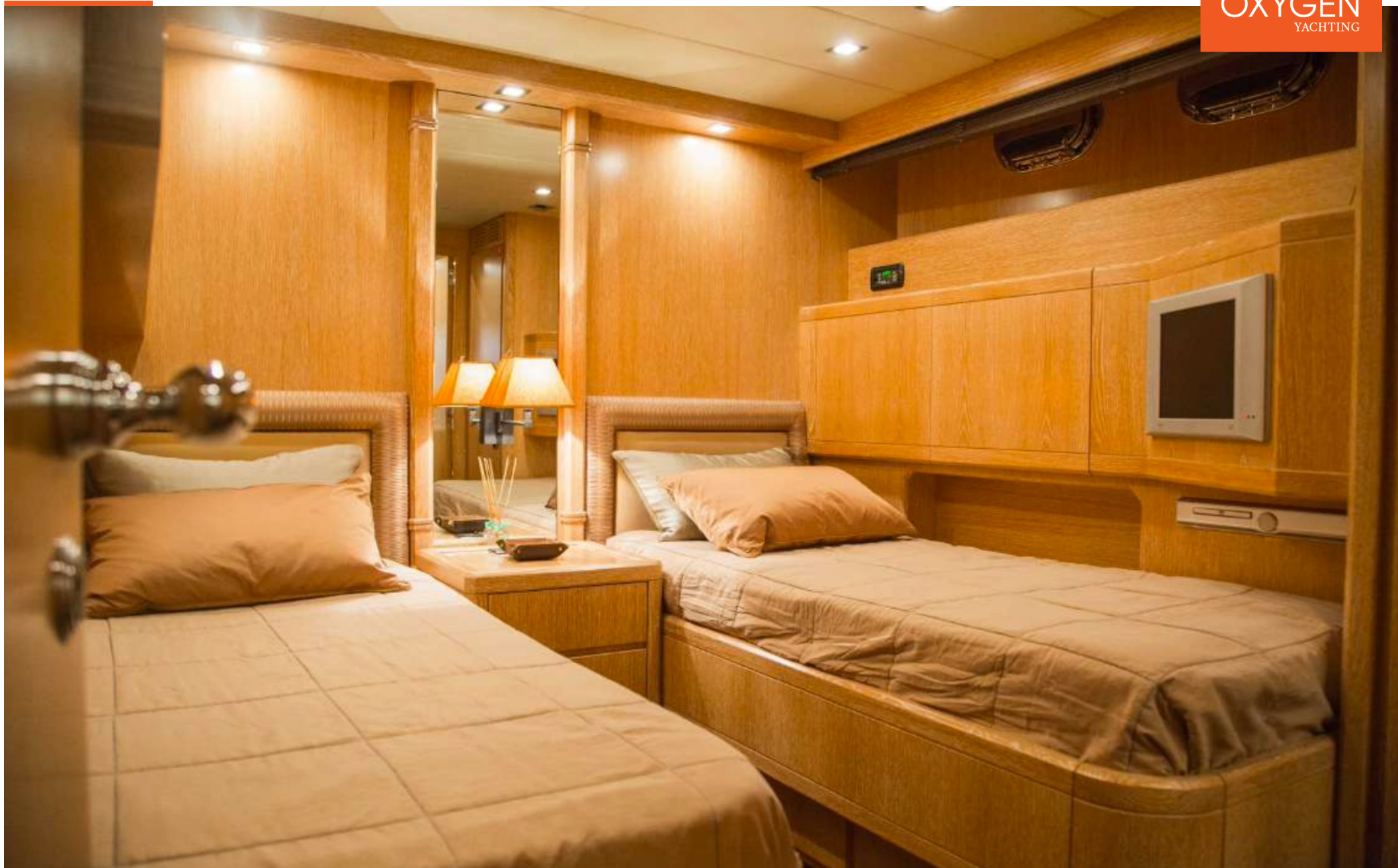
MANGUSTA 80 | 25m | 2005