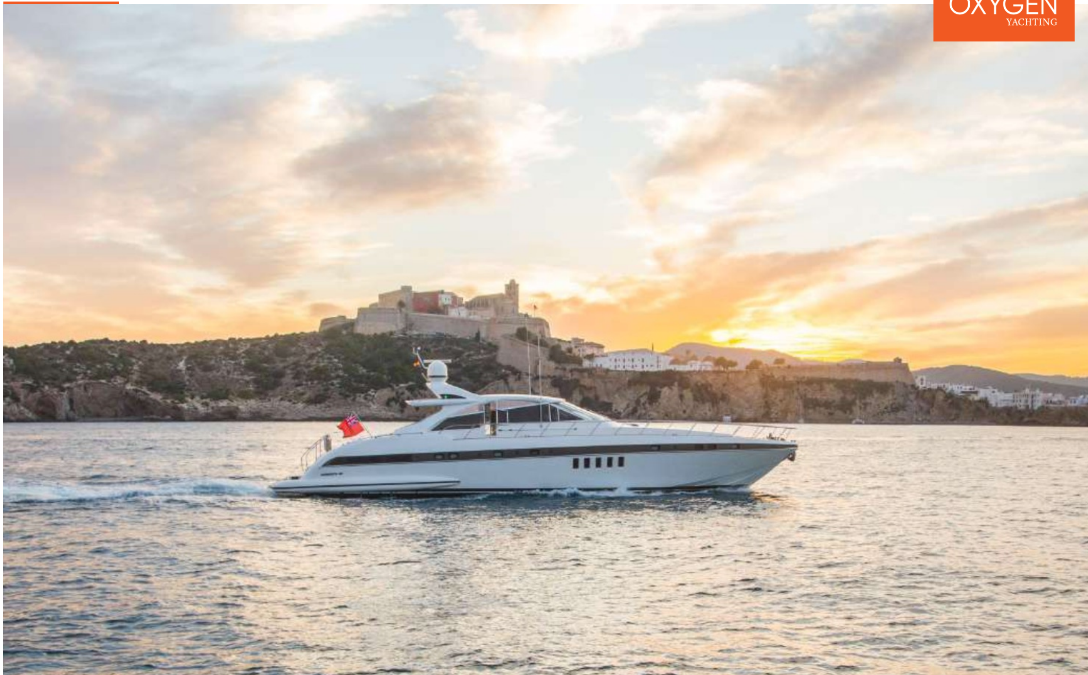
MANGUSTA 80 | 25m | 2005