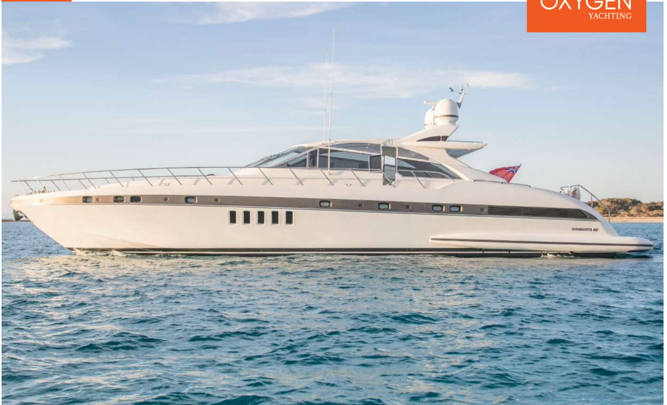
MANGUSTA 80 | 25m | 2005