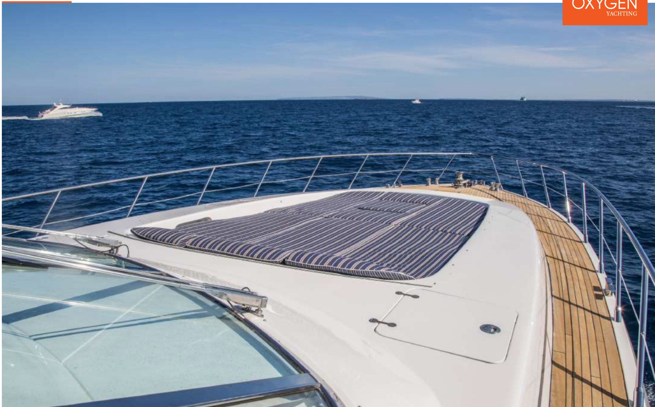
MANGUSTA 80 | 25m | 2005