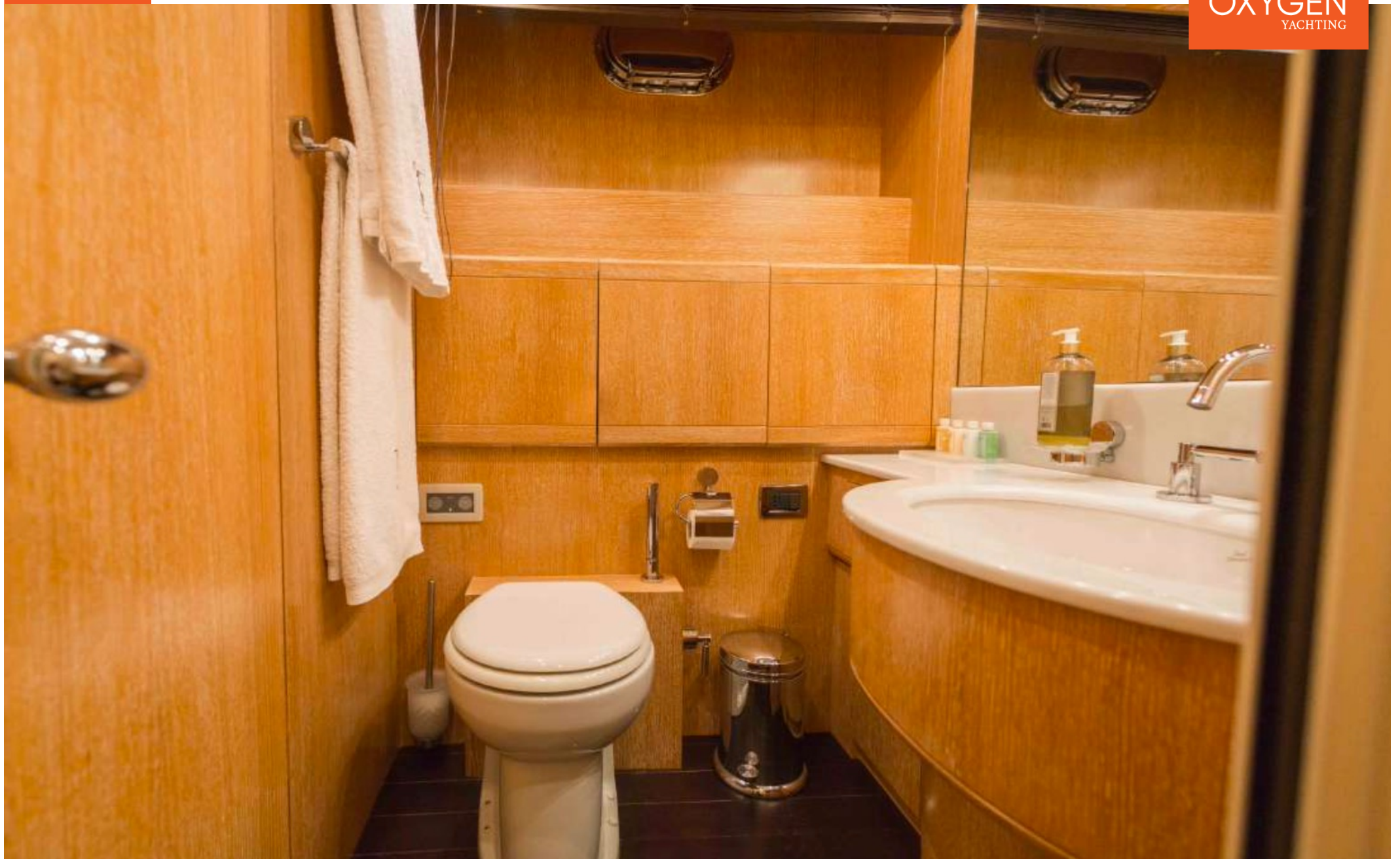
MANGUSTA 80 | 25m | 2005