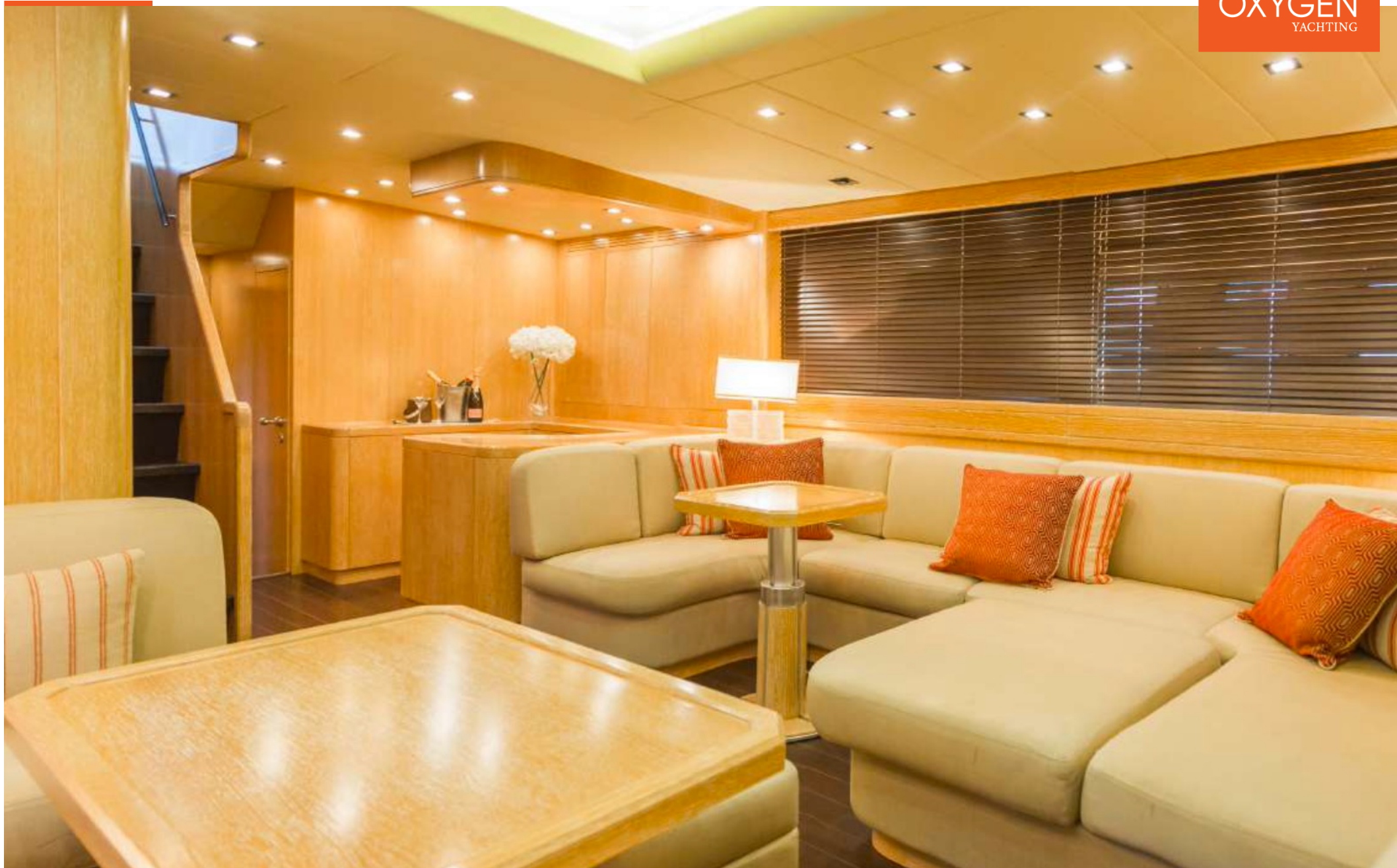
MANGUSTA 80 | 25m | 2005