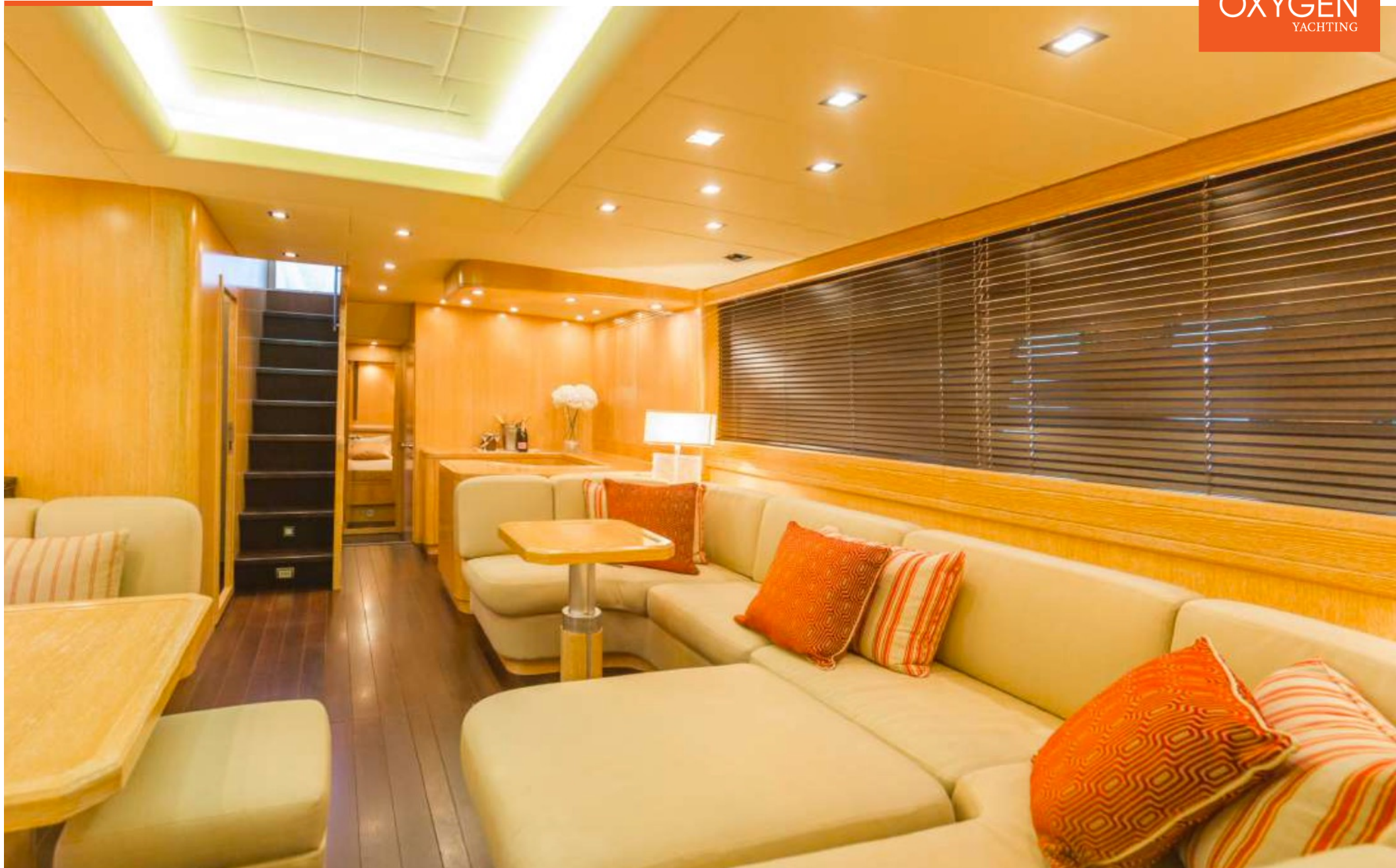
MANGUSTA 80 | 25m | 2005