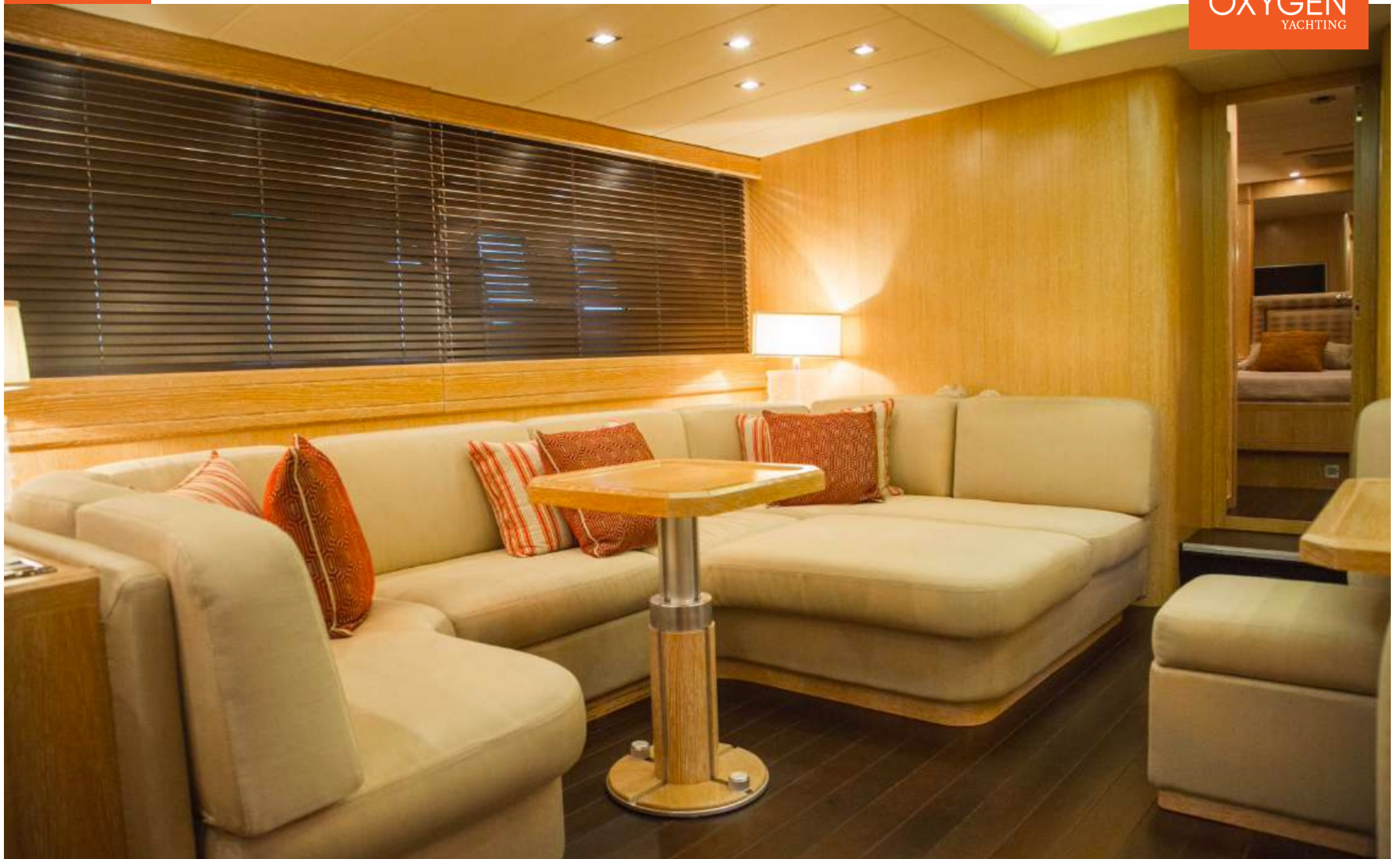
MANGUSTA 80 | 25m | 2005