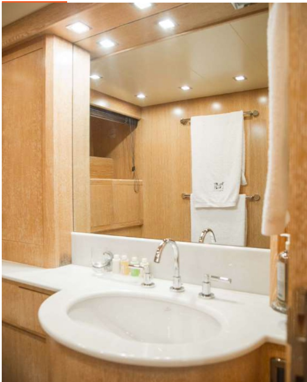
MANGUSTA 80 | 25m | 2005