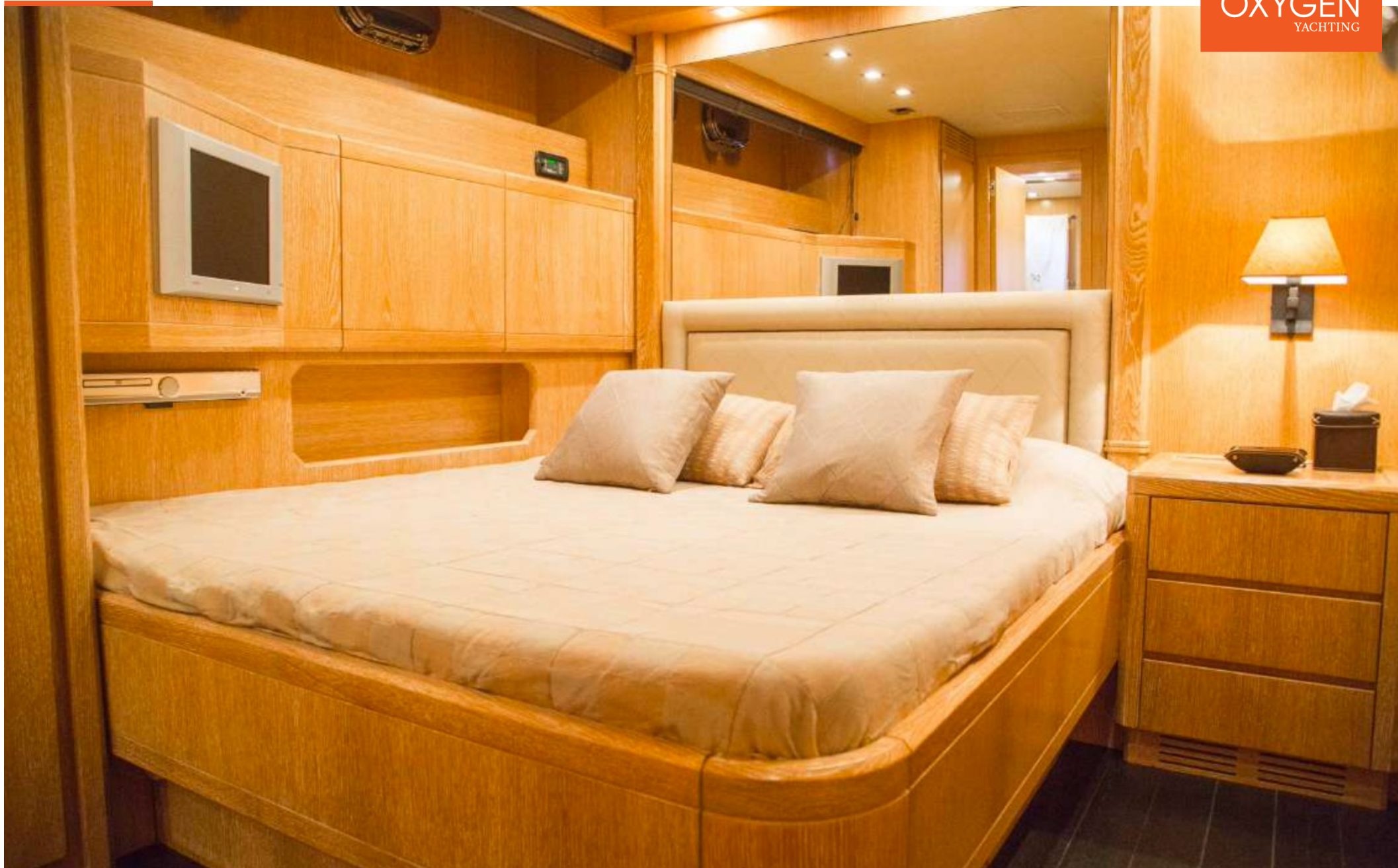
MANGUSTA 80 | 25m | 2005