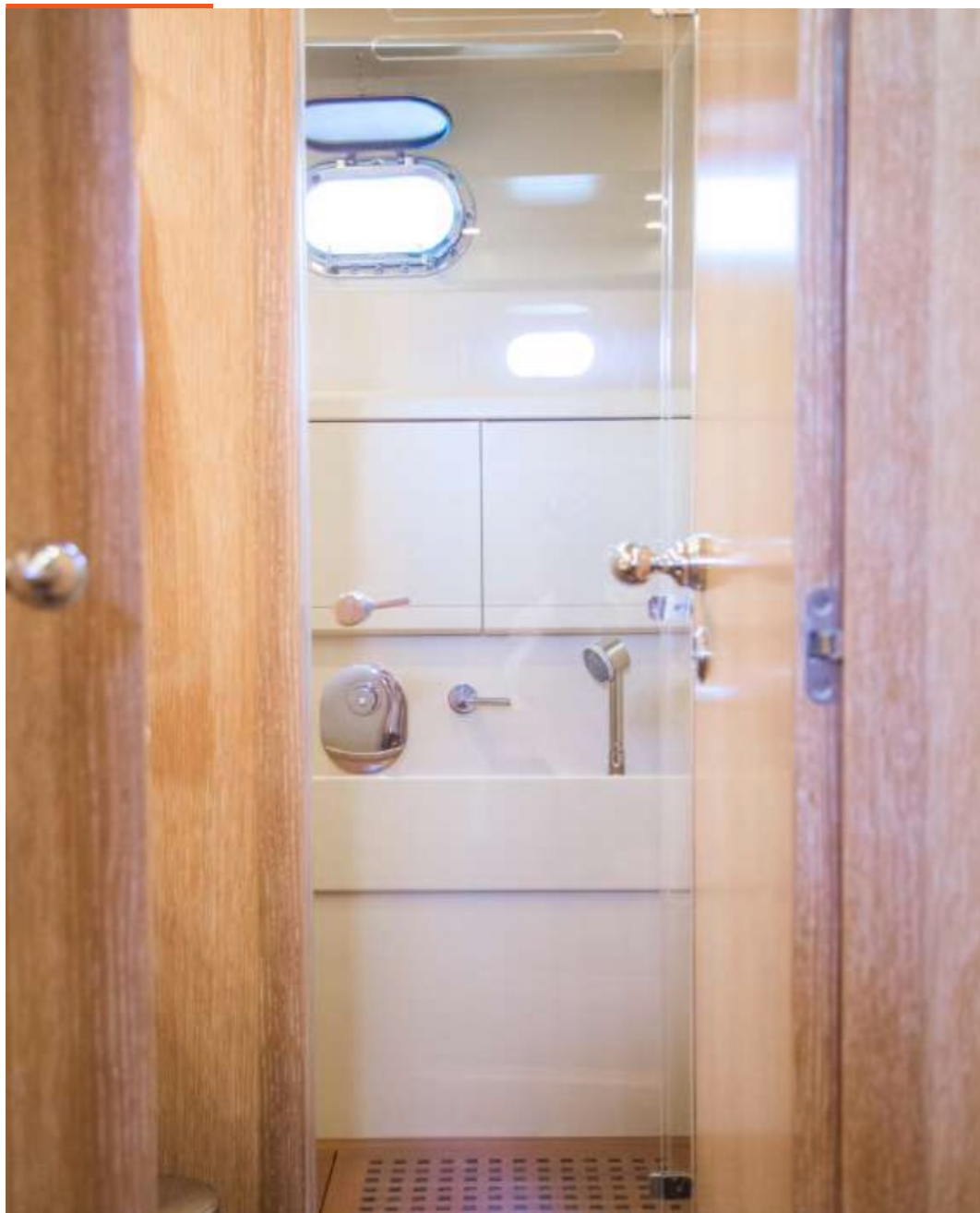
MANGUSTA 80 | 25m | 2005