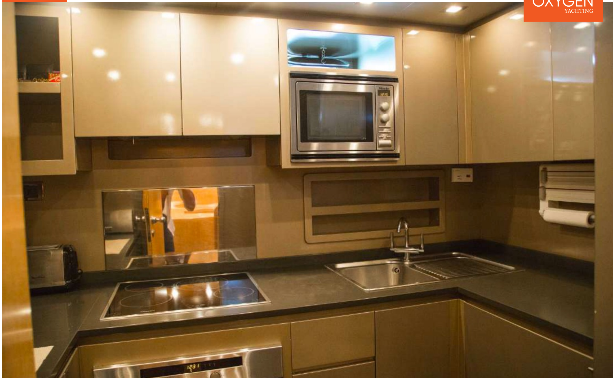
MANGUSTA 80 | 25m | 2005