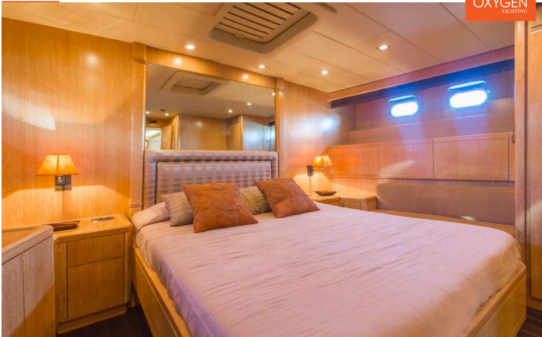
MANGUSTA 80 | 25m | 2005